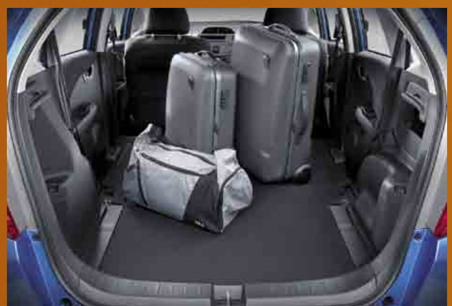
Utility mode With the back seats down, you'll have all the room in the world.

In Tall mode, raise the back seat cushions to fit four large suitcases or perhaps a tall shrub sitting upright. In Utility mode, fully collapse the rear seats to make space for your bicycle or just about anything else. And in Long mode, recline the front and rear seat to create a space long enough to fit a surfboard. If you're not into surfing, try a pair of skis. Or maybe hockey is more your thing. Well, anyway you get the point.