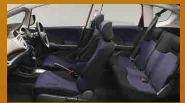
Blue/Black interior (GLi, GLi-SP & VTi models)

Colour says a lot about you. That's why Jazz comes in a range of dynamic colours to best suit your individual style.