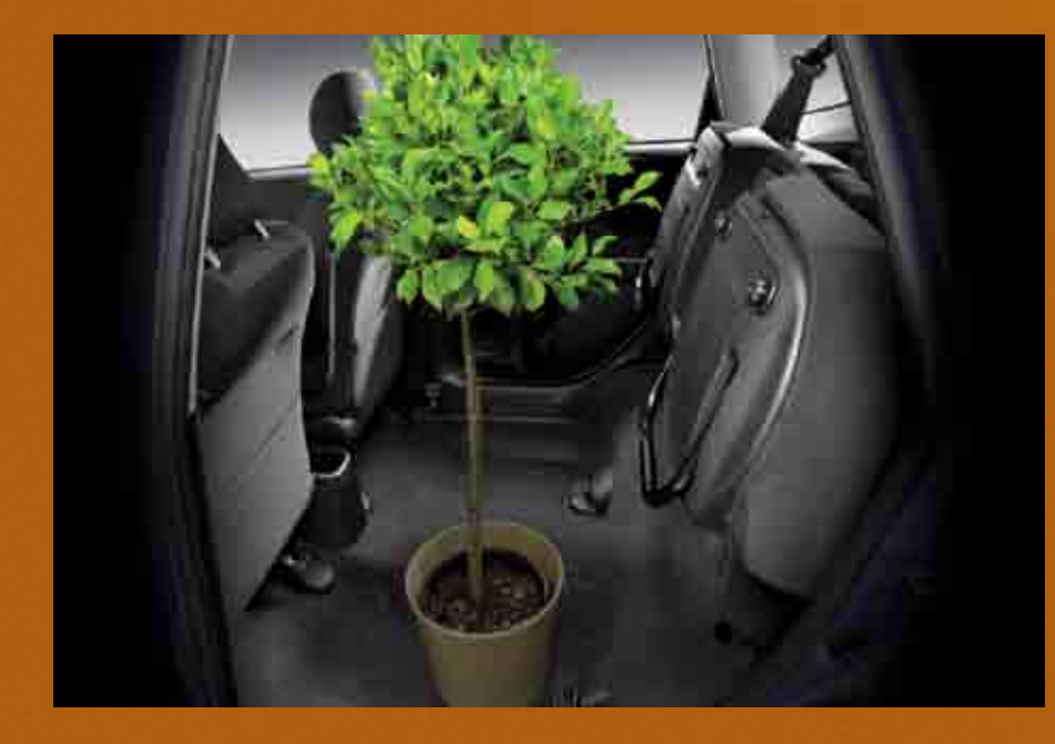
Tall mode Raise the back seat cushions to fit taller objects