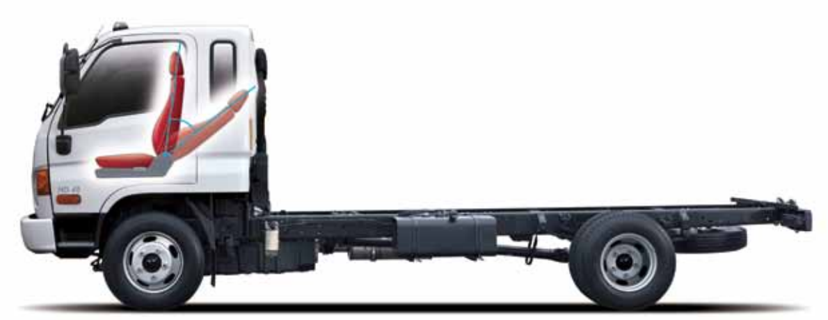
*Optional Super Cab