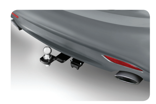
Towbar, Towball & Trailer Wiring Harness<sup>3</sup>