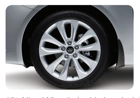
18" Alloy Wheels (sold singularly)