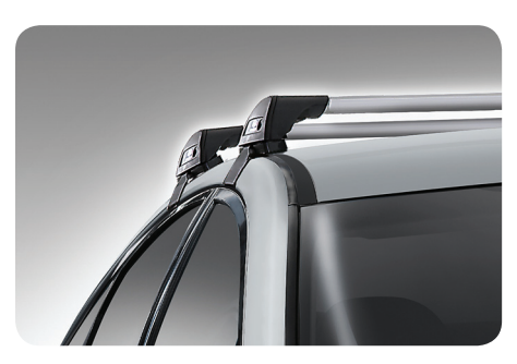
Whispbar™ Quiet Roof Racks<sup>4</sup>