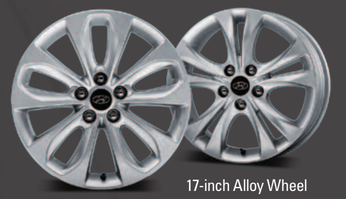
18-inch Alloy Wheel

Introduction Exterior Interior Technology Performance Safety Features Colour & Trim Accessories 🖳 WWW Prev Next