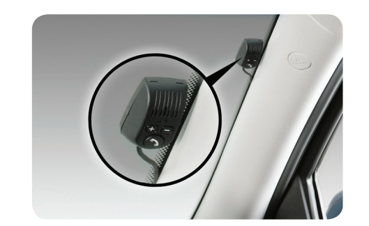
Bluetooth® Phone Kit<sup>2</sup>