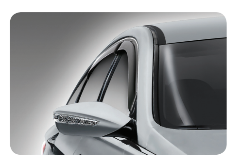
Stylevisors (set of 4)