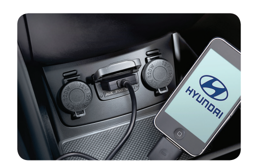
Direct Connect for iPod®1

All Genuine Hyundai Accessories are covered by Hyundai's 5 Year/Unlimited Kilometre Accessories Warranty* — an Australian first. Please refer to www.hyundai.com.au/i45 for full details.