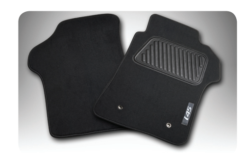
Tailored Carpet Floor Mats (set of 4)