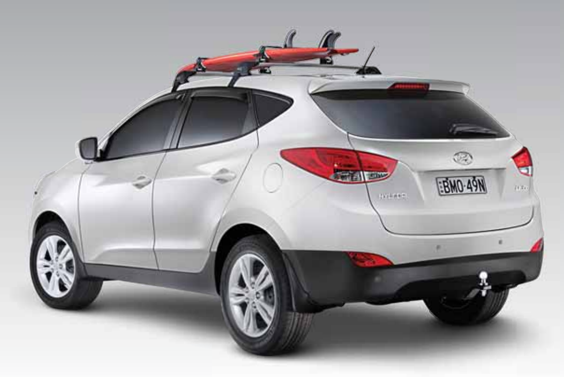
Hyundai ix35 Elite in Vanilla White featured above is accessorised with Genuine Hyundai Whispbar™ Quiet Roof Racks, Surfboard Carrier, Reverse Park Assist, Towbar, Towball and Trailer Wiring Harness, Stylevisors, 17" Alloy Wheels. All sold separately at additional cost. Surfboard not included.