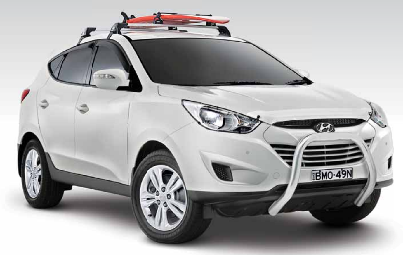
Hyundai ix35 Active in Vanilla White featured above is accessorised with Genuine Hyundai Whispbar™ Quiet Roof Racks, Surfboard Carrier, Alloy Nudge Bar, Bonnet Protector, Stylevisors, Front Park Assist, Headlight Protectors, 17" Alloy Wheels. All sold separately at additional cost. Surfboard not included.

All Genuine Hyundai Accessories are covered by Hyundai's Australian First 5 Year/Unlimited Kilometre Accessories Warranty*. Please refer to www.hyundai.com.au/ix35 for full details.