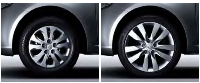
195 / 65R 15" Steel Wheel

Designed from the ground up. The Cerato comes with 15-inch steel wheels with a single 5 split-spoke cap style. While the Cerato SLi model is equipped with the ultimate 5 split-spoke 17-inch alloy wheels.