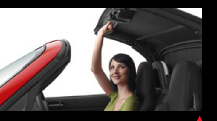
Reach for the sky. Opening the Z-folding soft-top is a quick, simple operation.

A winding road in front of you and the sky above you. Driving doesn't get any more enjoyable than this. The only question is, how do you want to get your fresh air thrills? In Roadster Coupe it couldn't be easier. Press a button and in just 12 seconds the powerretractable roof takes you from coupe-like refinement to the open air. Alternately there's the classic Soft-top.