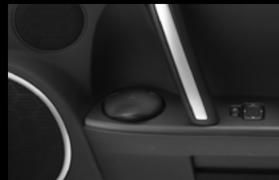
Ashtray. Sits in the door to allow easy reach.