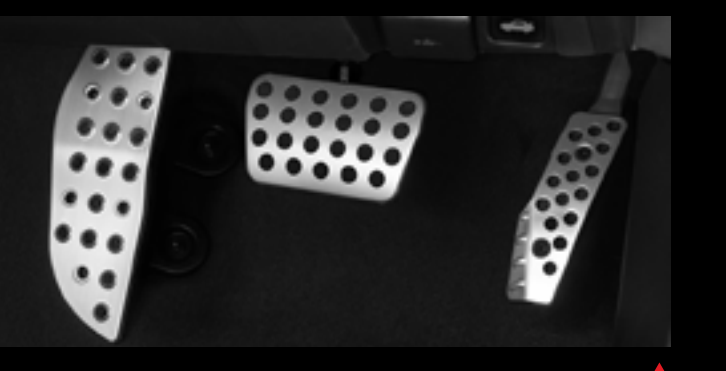
Polished performance. MX5 features aluminium pedals to enhance sports driving.

reduced. So MX-5 follows your steering inputs with uncanny accuracy and feels even more planted on the road. And while this faithful handling will give you confidence, standard Dynamic Stability Control (DSC) will enhance it. Working with the 4-wheel ABS, this advanced system manages engine power and braking force to maintain control, even on slippery roads. In MX-5 you'll take every corner with a smile on your face.