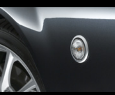
Side indicator bezel. Turn on a touch of elegance.

Aluminium scuff plate. Protects against marks with style.