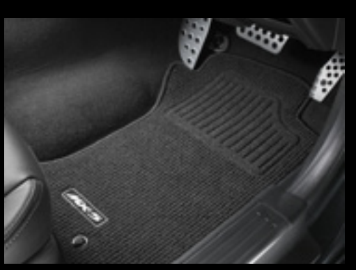
Floor mats. Look great and keep your carpet clean.