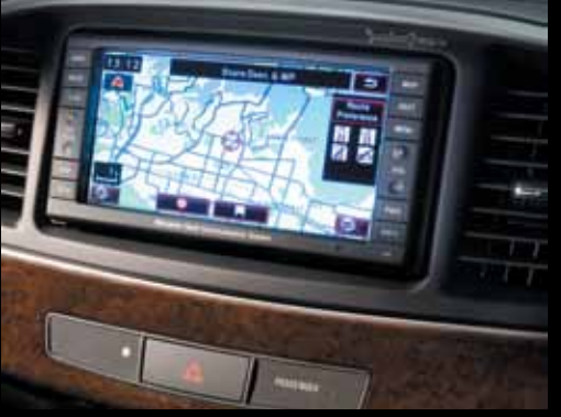
MITSUBISHI MULTI COMMUNICATION SYSTEM (MMCS)

Other features that do the thinking for you include Smart Key which provides key-less entry and operation, Dusk Sensing Headlamps and Rain Sensing Wipers.