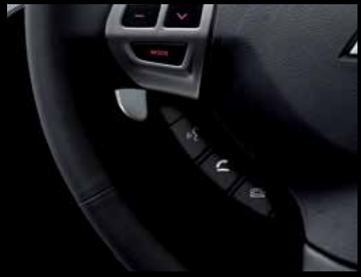
BLUETOOTH® PHONE CONNECTIVITY