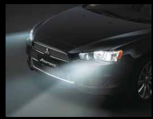
HID HEADLAMPS WITH AFS