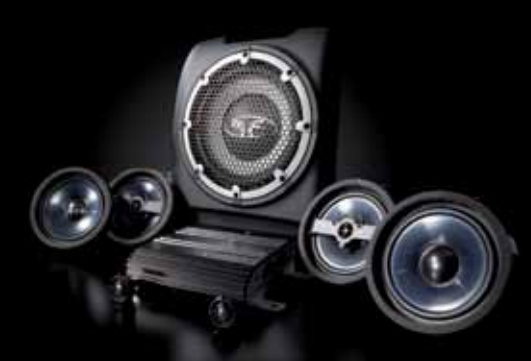
ROCKFORD FOSGATE® PREMIUM AUDIO SYSTEM