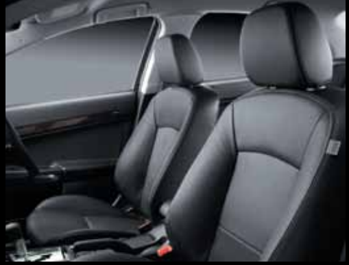
LEATHER TRIMMED SEATS