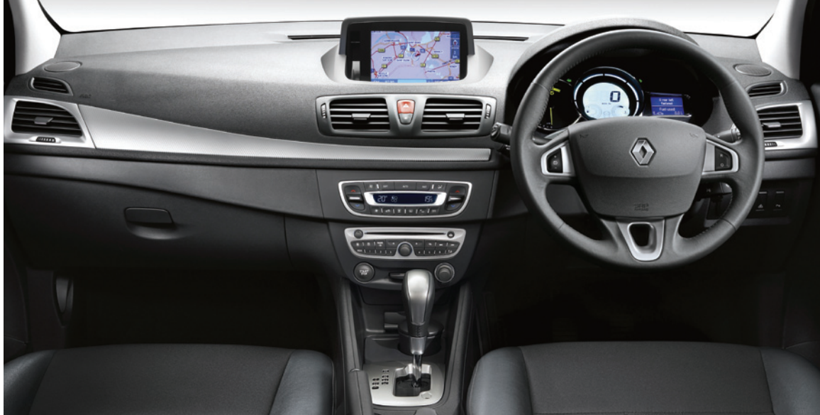
PRIVILEGE Style and elegance.