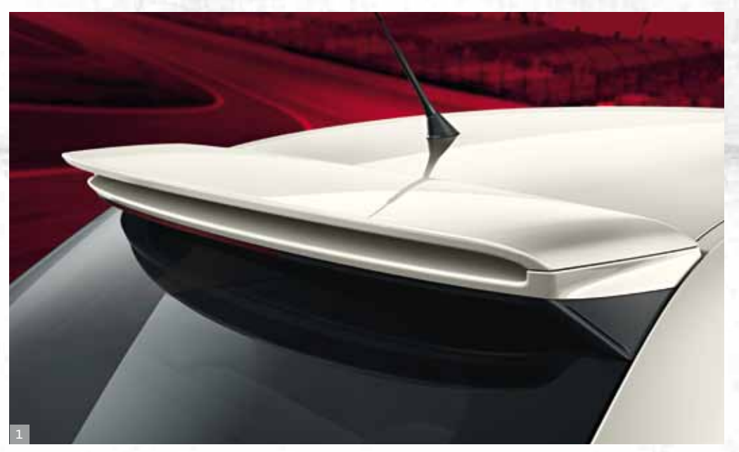
<sup>1</sup> Available as factory-fitted optional equipment or at a later date from your Audi partner.

Its athletic design completes the rear in a striking manner. The ideal complement to the aerodynamics competition kit.