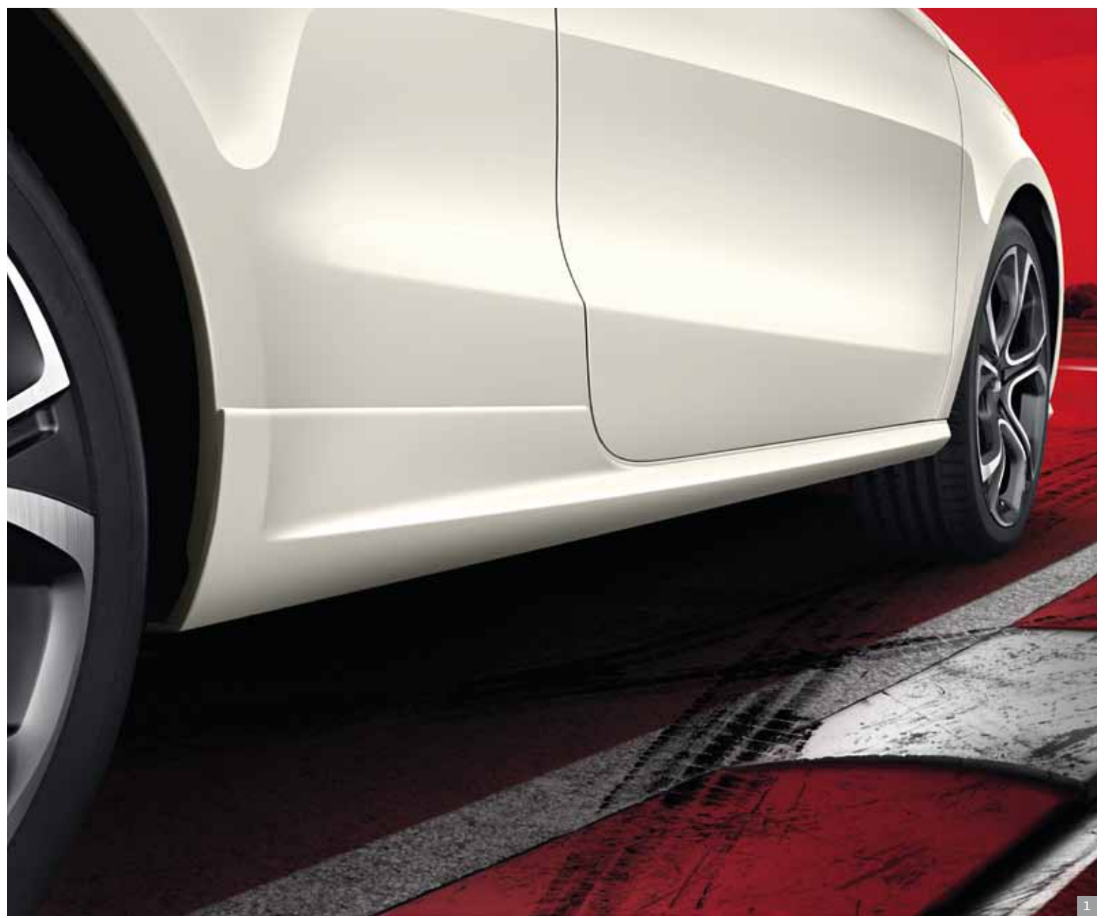
<sup>1</sup> Available as factory-fitted optional equipment or at a later date from your Audi partner. <sup>2</sup> Not in conjunction with the trailer towing hitch.