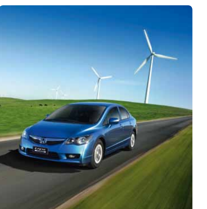
2009 Civic Hybrid shown in Neutron Blue.

and Service Log Book for schedule services.