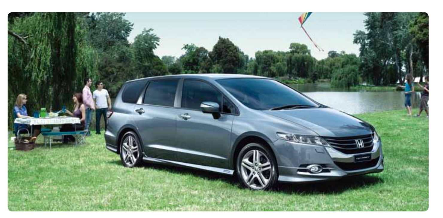
2009 Odyssey Luxury shown in Polished Metal.