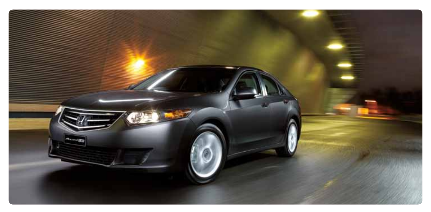
2010 Euro shown in Volcano Grey.

Part of Honda's unique G-CON technology, the Advanced Compatibility Engineering (ACE) body structure absorbs the energy from an impact and actively channels it away from the passenger compartment, providing the utmost protection for driver and passengers.