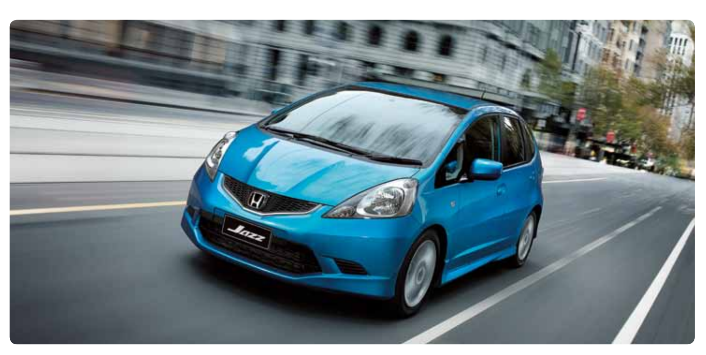
2010 Jazz VTi-S shown in Cerulean Blue.