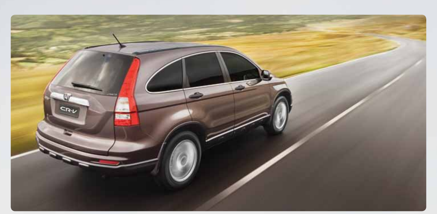
2010 CR-V shown in Urban Titanium.