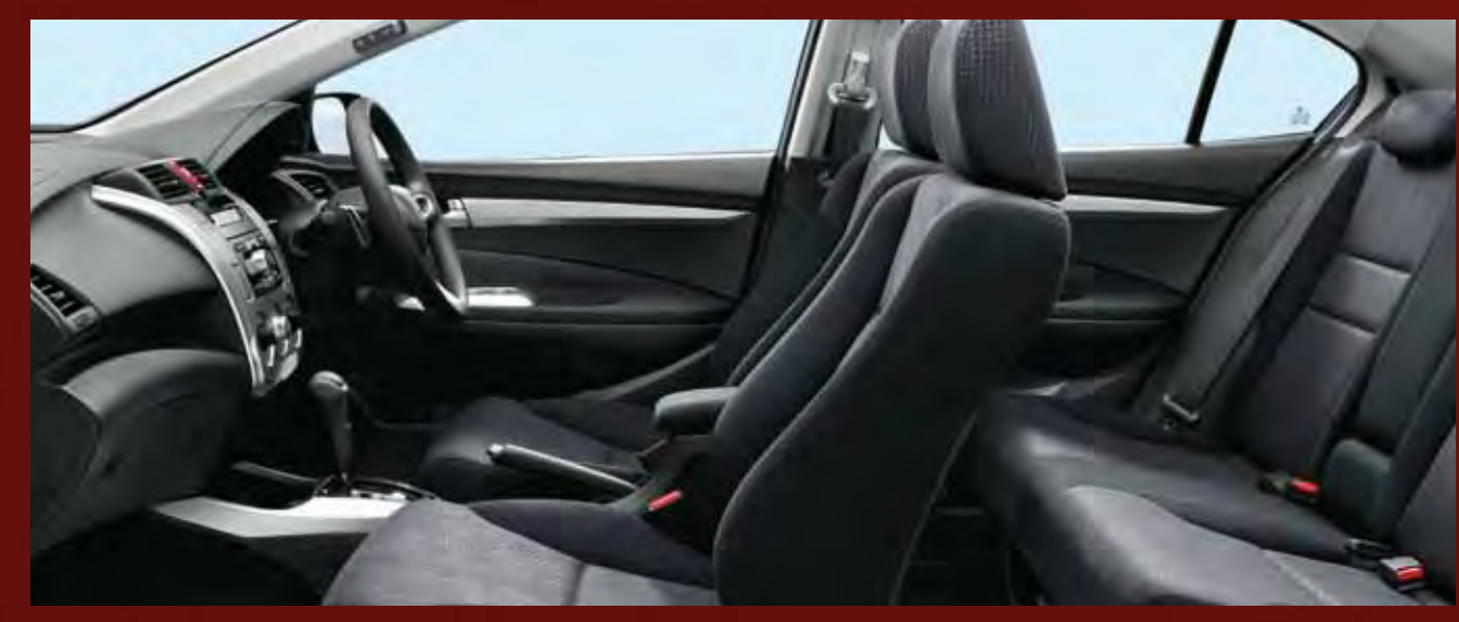
VTi comes with Black interior. VTi-L comes with Premium Black interior (as shown above).