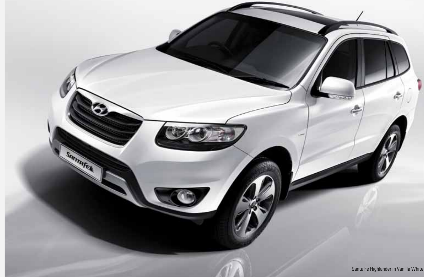
Santa Fe Highlander in Vanilla White shown.

Designed to fit the individual contours of your new Santa Fe R these tough, durable, acrylic Headlight Protectors ensure that chips and marks on your headlight lenses don't compromise your night-time driving safety. A Genuine Hyundai Bonnet Protector helps you maintain your Santa Fe R's pristine showroom looks by guarding against unsightly pitting from stone chips. Made from tough, durable, shock-resistant acrylic that's UV resistant to prevent cracking, fading and distortion they're also easily removed for cleaning, which simply requires hot soapy water.