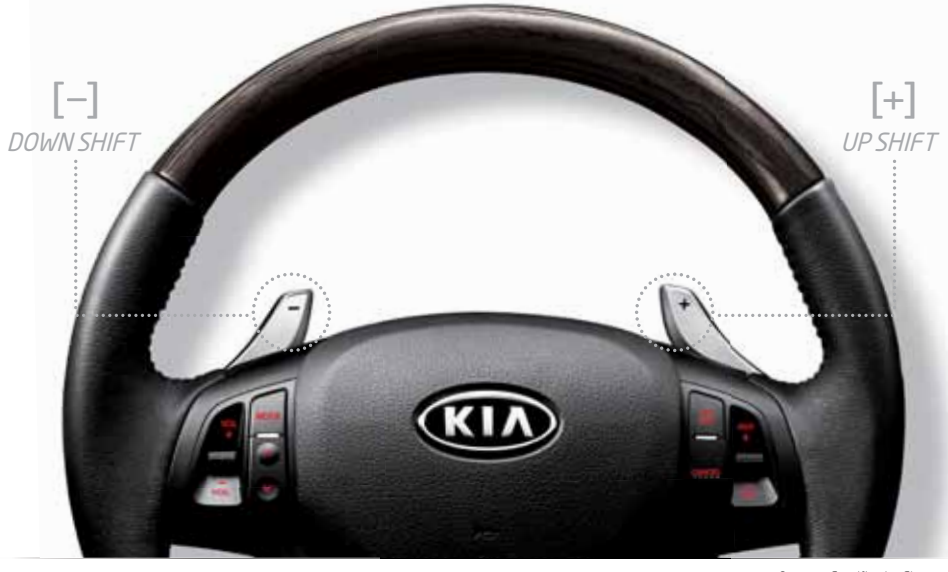
Overseas Specification Shown Paddle shifters

Paddle shifters bring an exciting new dimension to your driving through their ability to make lightning-quick gear changes. Positioned at the end of your fingertips just behind the steering wheel, they do away with the need to take your hands off the wheel in order to shift gears.