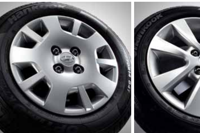
14-inch steel wheels (Active)