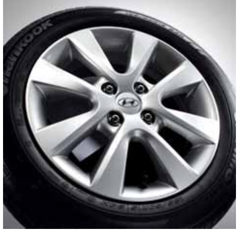
15-inch alloy wheels (Elite)