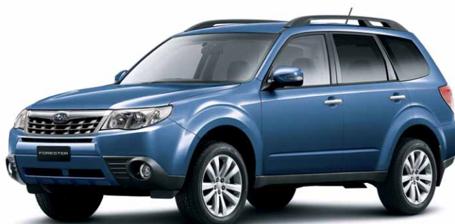
MARINE BLUE METALLIC