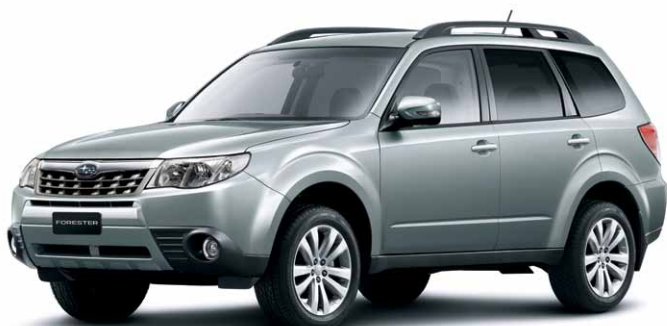
SAGE GREEN METALLIC 1