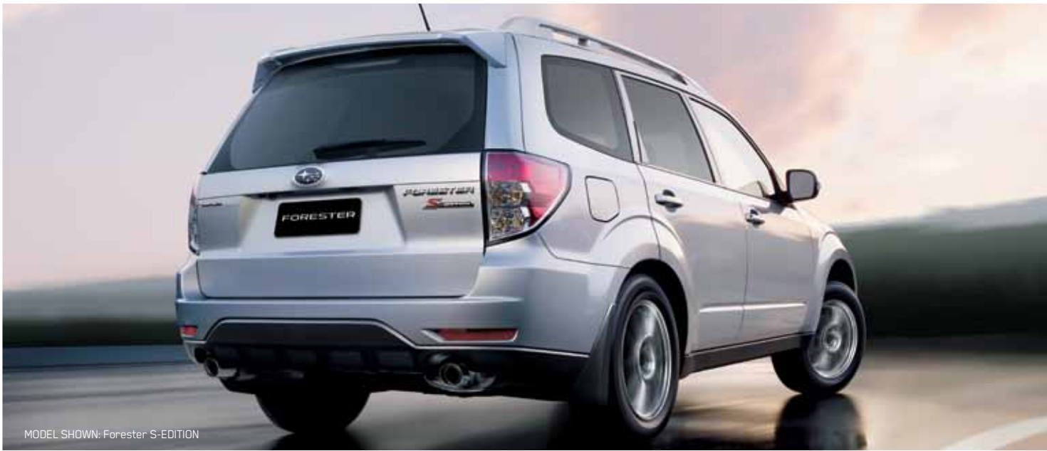
MODEL SHOWN: Forester S-EDITION