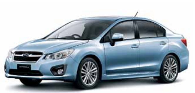
SKY BLUE METALLIC<sup>1</sup>