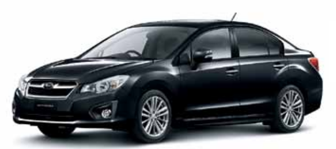
OBSIDIAN BLACK PEARL