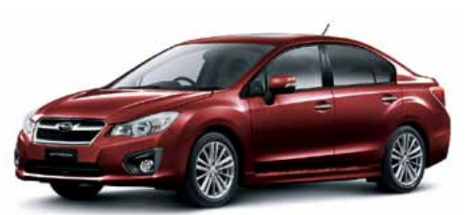
CAMELLIA RED PEARL