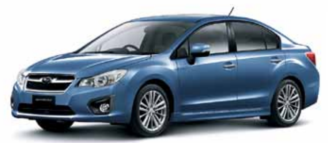
MARINE BLUE PEARL