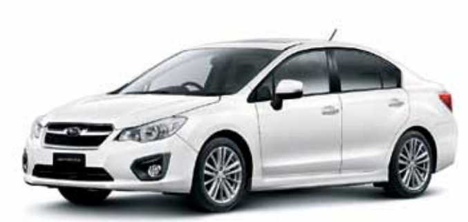
SATIN WHITE PEARL

check with your authorised Subaru Retailer regarding colour availability of your selected model before purchase.