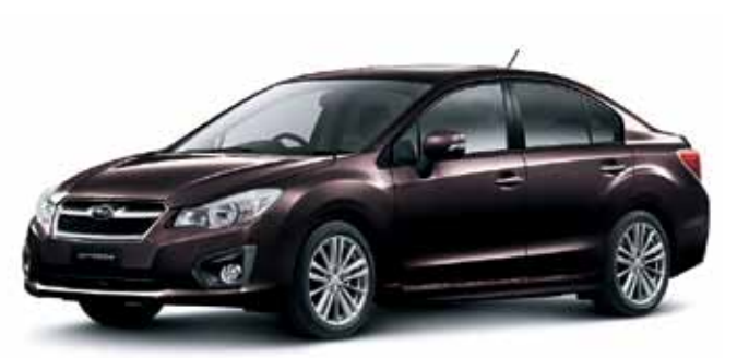
DEEP CHERRY PEARL