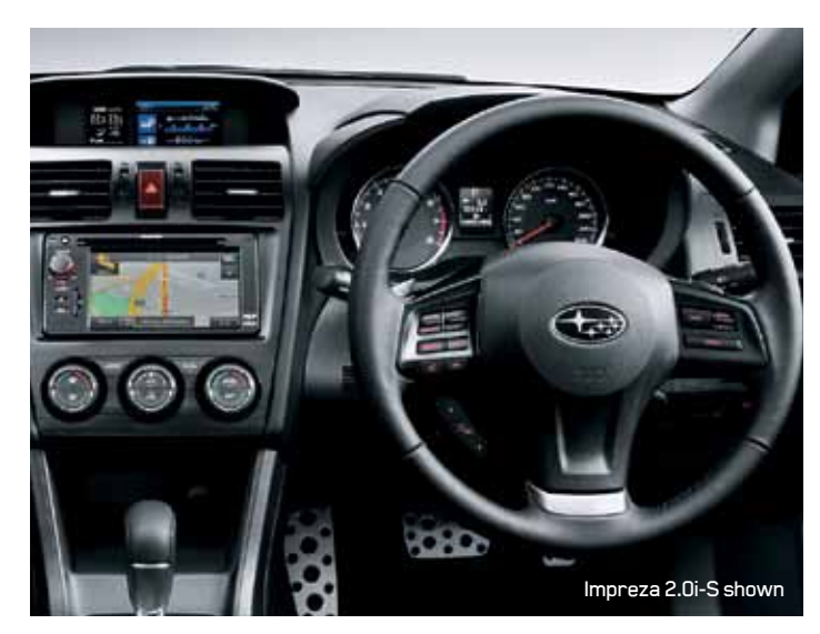
MULTI-FUNCTION DISPLAY UNIT (MFD): IMPREZA 2.0i-L AND IMPREZA 2.0i-S