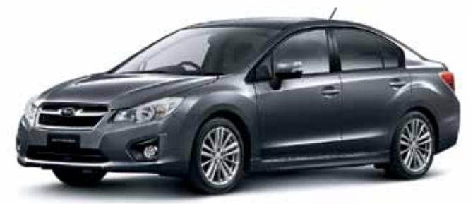
DARK GRAY METALLIC