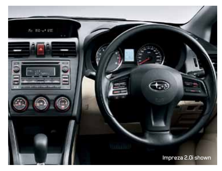
MULTI-INFORMATION DISPLAY: IMPREZA 2.0i