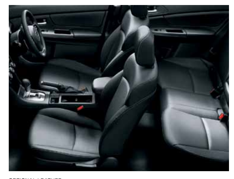
OPTIONAL LEATHER: BLACK OR IVORY: IMPREZA 2.0i-S