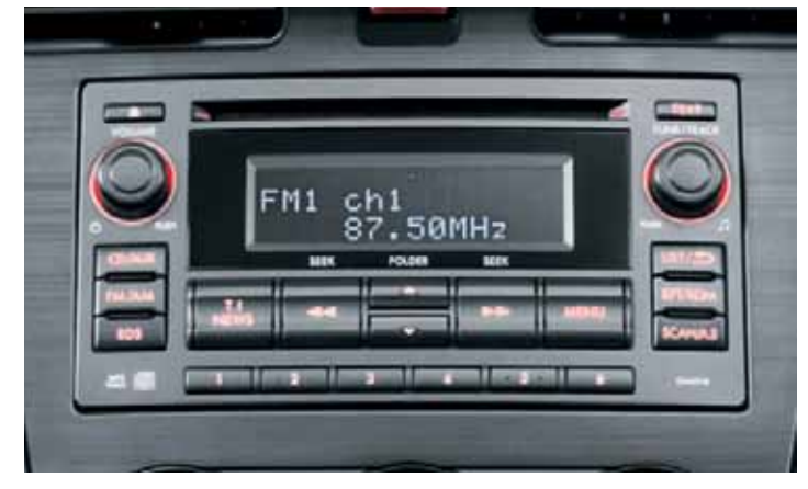
SINGLE IN-DASH CD PLAYER: IMPREZA 2.0i, IMPREZA 2.0i-L AND IMPREZA 2.0i-S