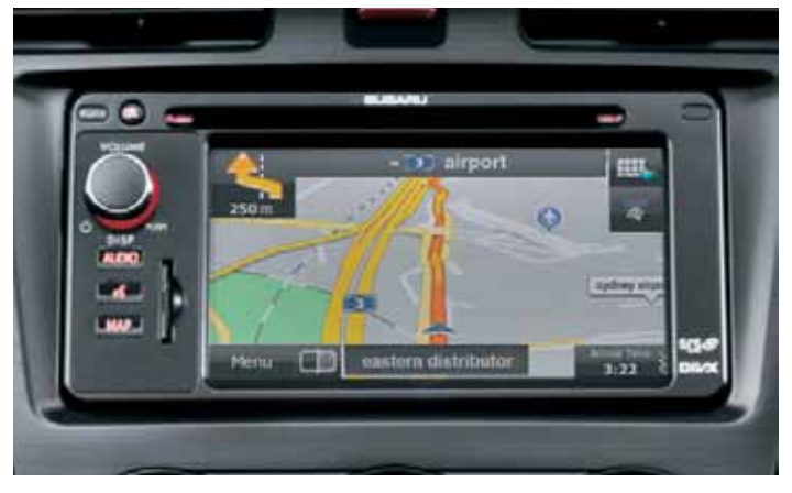
MULTI-INFORMATION IN-DASH SATELLITE NAVIGATION SYSTEM: OPTIONAL FOR IMPREZA 2.0i-L AND IMPREZA 2.0i-S