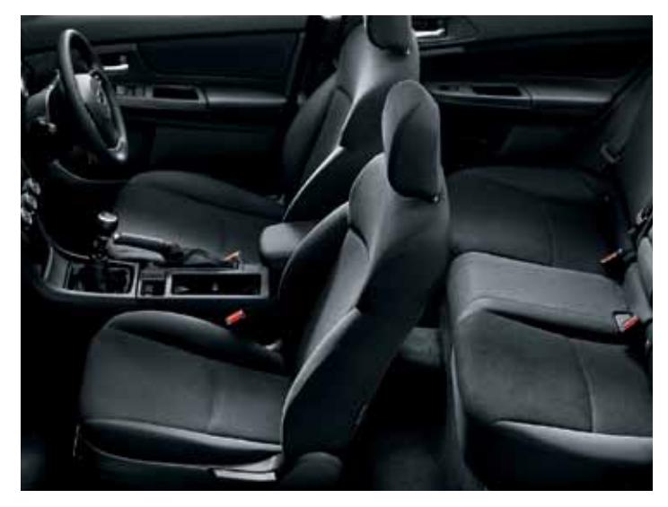
CLOTH: BLACK: IMPREZA 2.0i, IMPREZA 2.0i-L AND IMPREZA 2.0i-S IVORY: IMPREZA 2.0i AND IMPREZA 2.0i-L