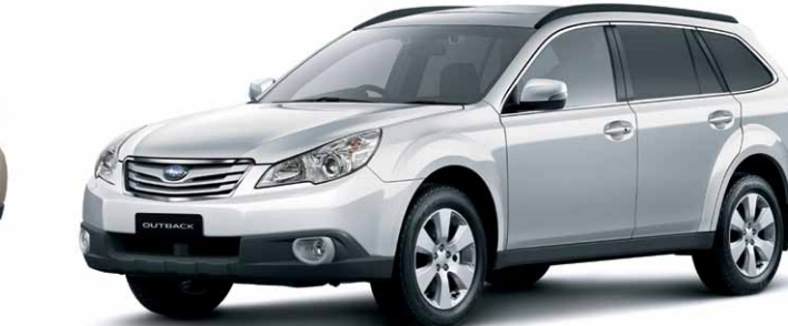
ICE SILVER METALLIC