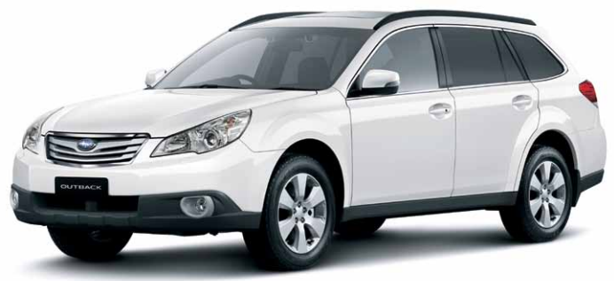
SATIN WHITE PEARL

One of the final choices – but one of the most important! The colour you choose for your Outback makes a bold statement about who you are. So we've made sure you've got lots of ways to express yourself – with a wide range of colours to make your Outback more... you.