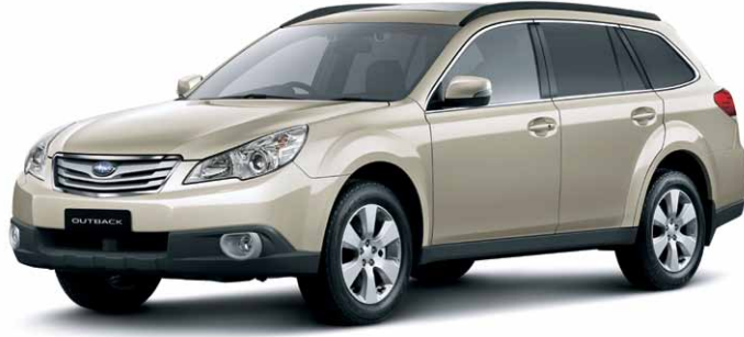
SUNLIGHT GOLD OPAL