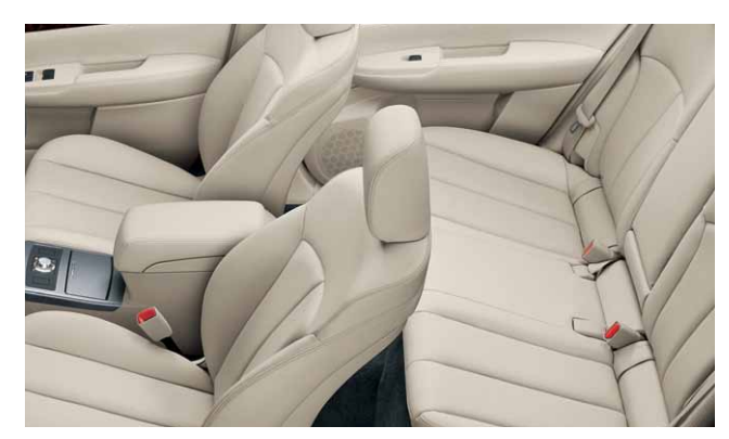
IVORY: Leather: Outback 3.6R Premium

BLACK: Cloth: Outback 2.5i and Outback 2.0D Leather: Outback 2.5i Premium, Outback 3.6R Premium and Outback 2.0D Premium