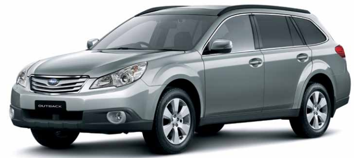
SAGE GREEN METALLIC