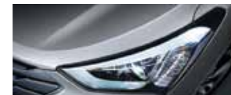
Titanium Silver (Metallic) – T6S