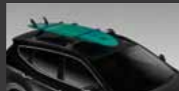
Surfboard Carrier • Soft Cradle • Secure