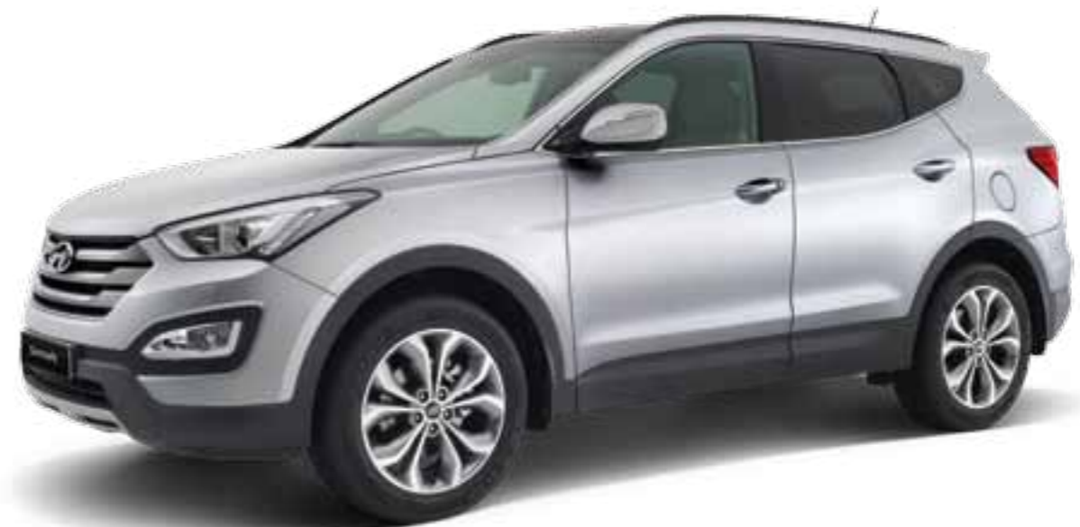
Hyundai Santa Fe Highlander featured above in Sleek Silver