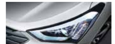
Sleek Silver (Metallic) – P3S