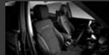
Seat Covers • Water Resistant • Tailored Fit