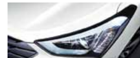
Creamy White (Solid) – PCW