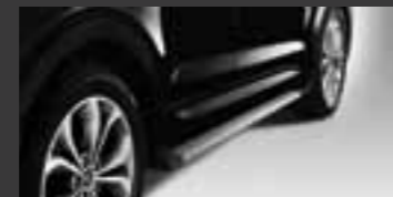
Side Steps • Durable • Strong