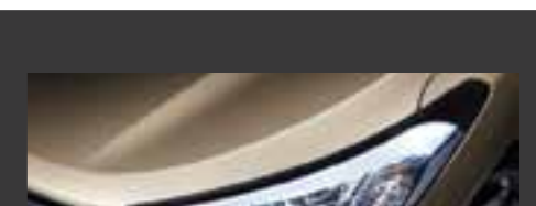
Beach Sand (Metallic) – S8P