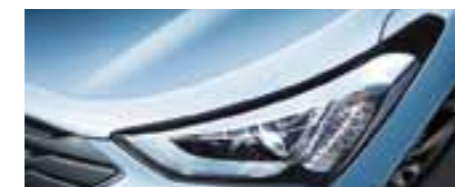
Glacier (Metallic) – V8U