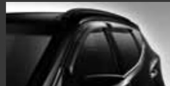
Tinted Stylevisors • Slimline • UV Resistant