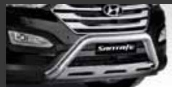
Alloy Nudge Bar • Stylish • Stringently Tested