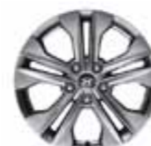
17" Alloy Wheels (Active)