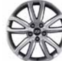
18" Alloy Wheels (Elite)