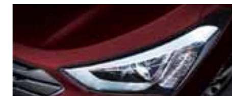
Red Merlot (Pearl) – VR6