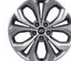
19" Alloy Wheels (Highlander)

Colours are indicative only and may vary due to the printing process.