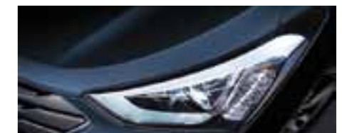
Ocean View (Metallic) – W8U