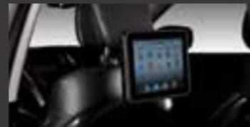
iPad® 1 Holder • Convenient • Functional