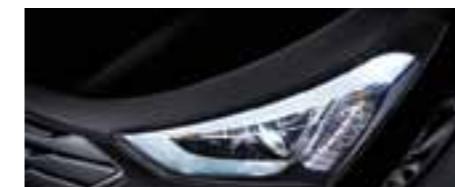
Phantom Black (Metallic) PKA