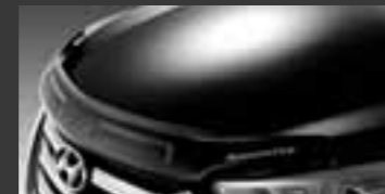
Bonnet Protector (smoked) • UV-Resistant • Shock Resistant