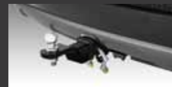
Towbar, Towball & Trailer Wiring Harness 4 • Specifically Designed • Australian Standards Compliant