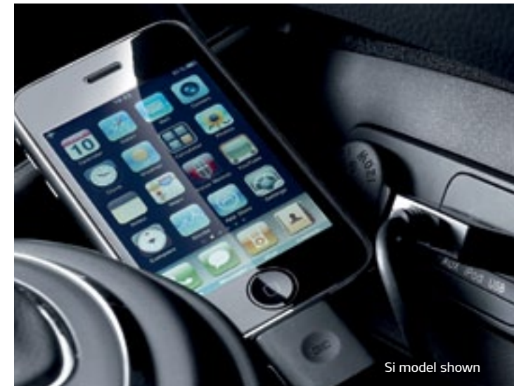
Si model shown