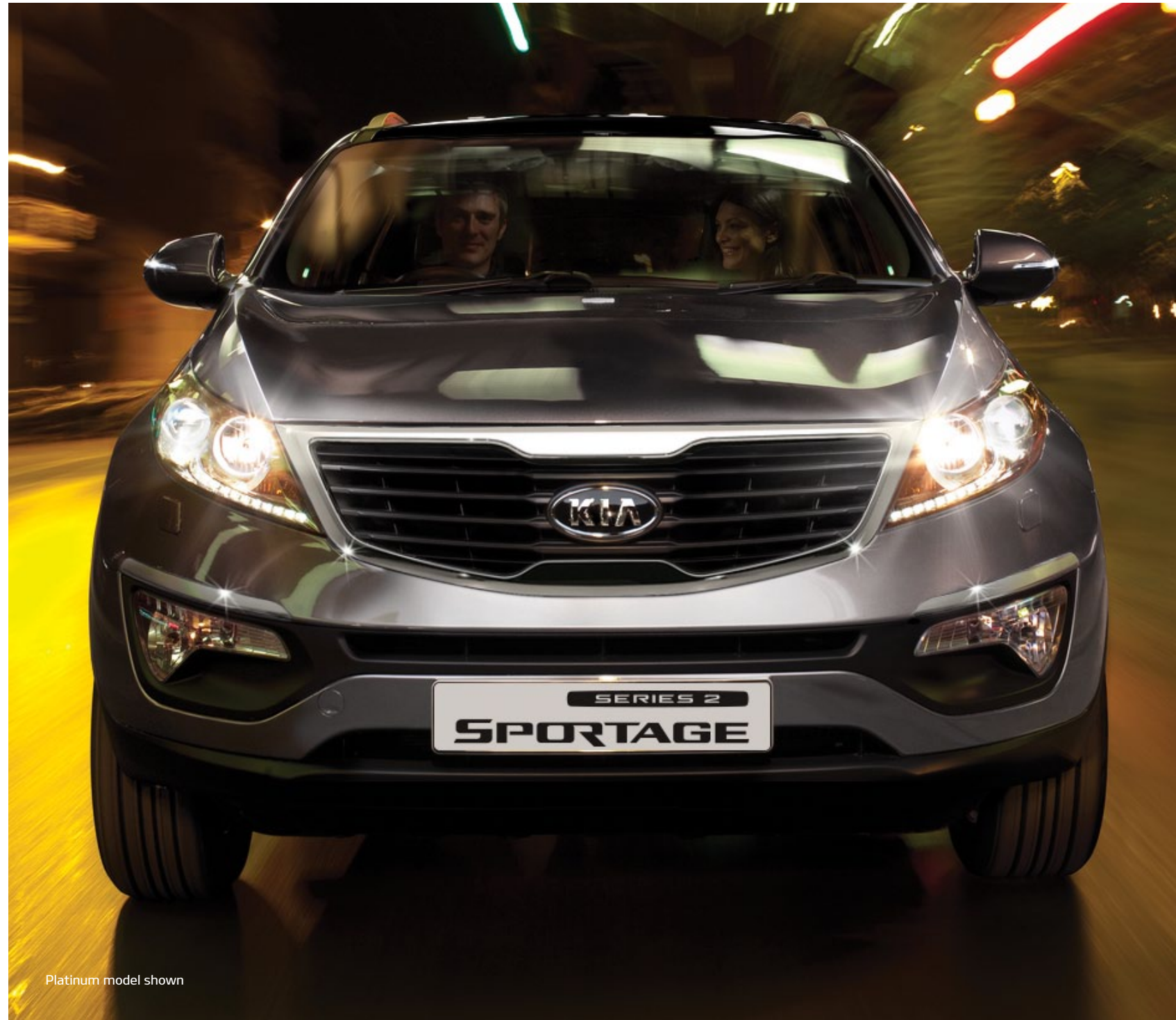
Platinum model shown

The standard rear-view camera on SLi & Platinum models ensure your Sportage stays beautiful and scratch free. When reversing, the rear-view mirror automatically displays guidelines to give a clear indication of the space left behind you.