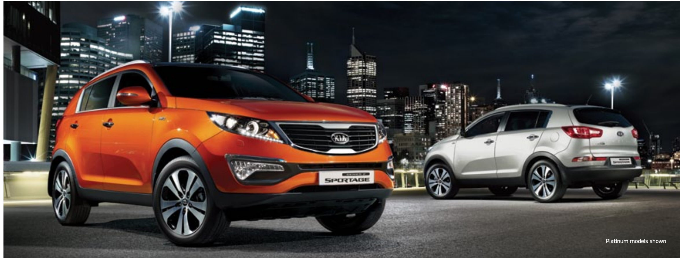
Platinum models shown

7" vivid colour touch screen satellite navigation system with SUNA™ live traffic updates (SLi with Navigation Pack and Platinum), will help get you to your destination faster.