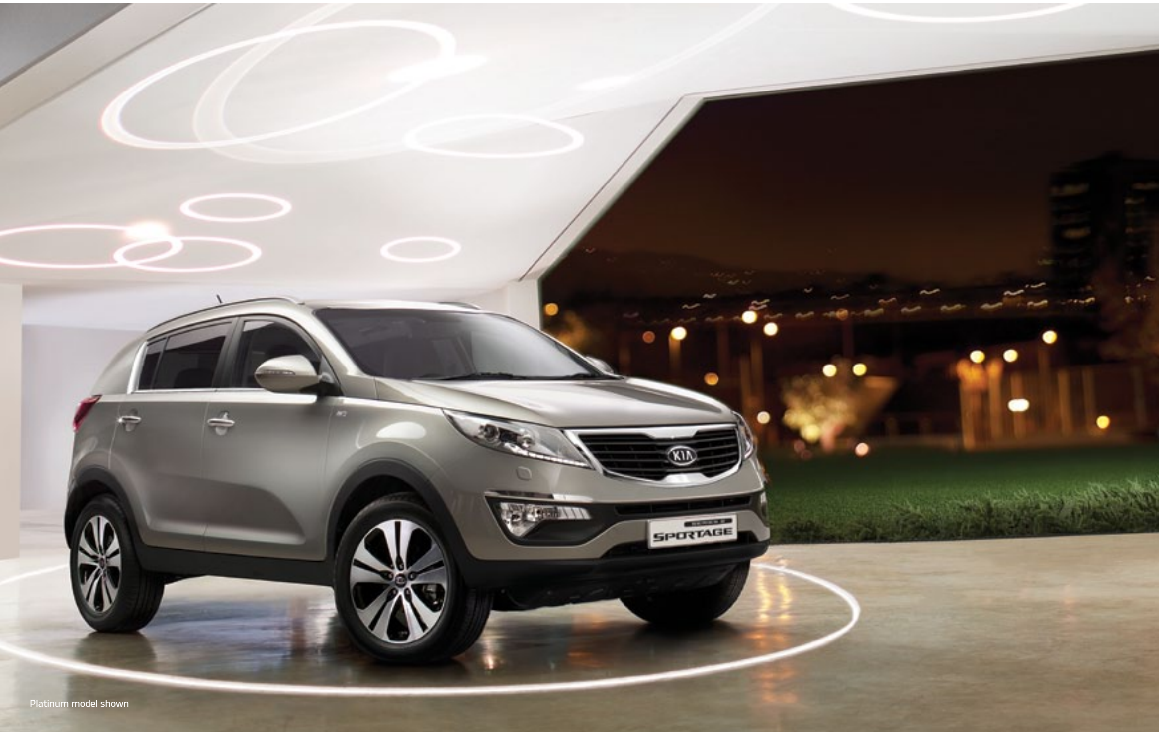
Platinum model shown