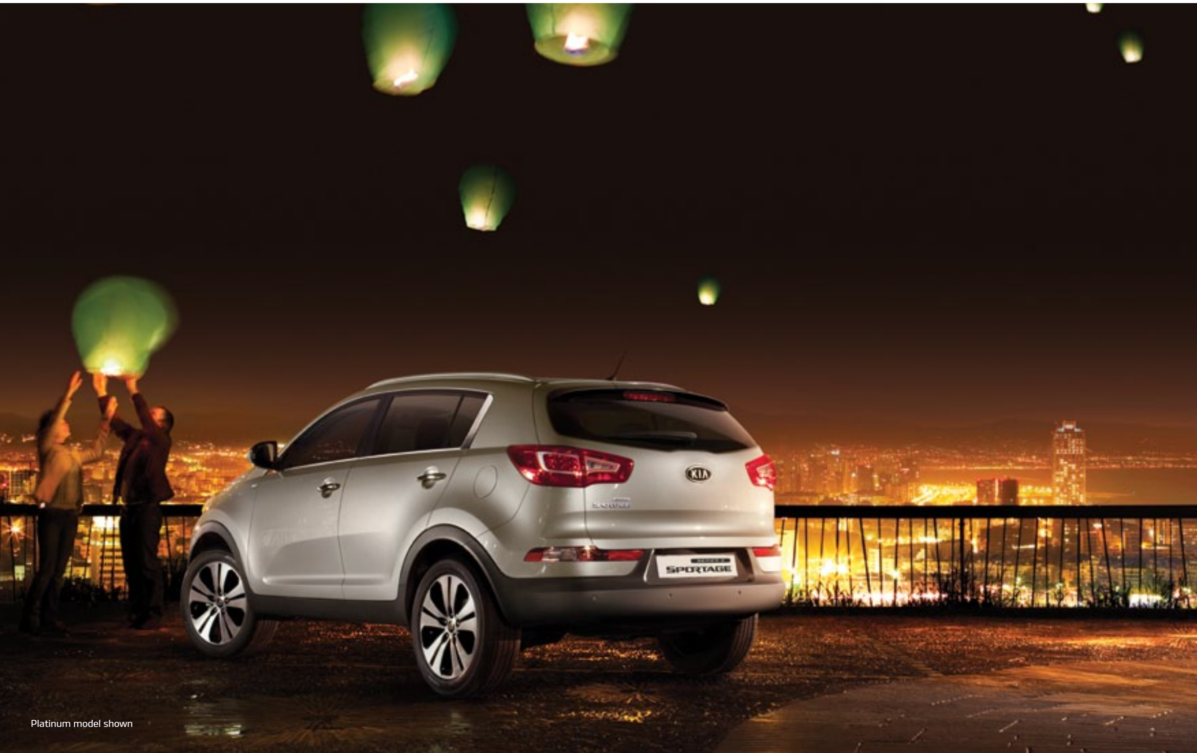
Platinum model shown