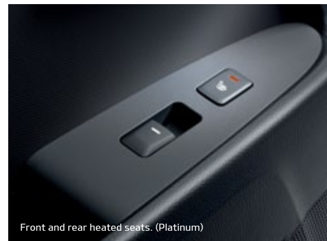
Front and rear heated seats. (Platinum)