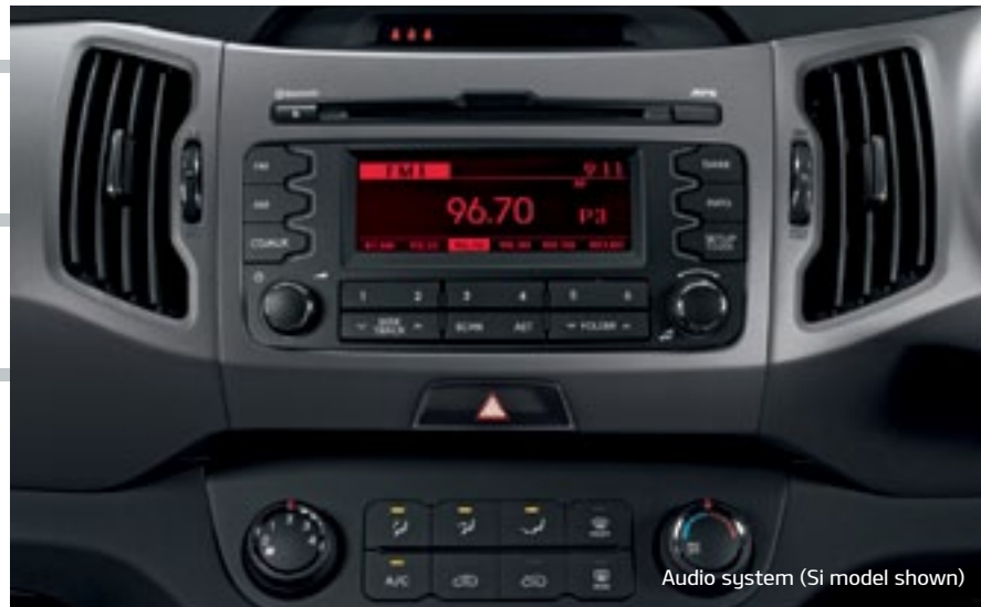
Audio system (Si model shown)

The Bluetooth® word mark is owned by Bluetooth SIG, Inc. iPod® is a registered trademark of Apple Inc., registered in the US and other countries. *Not all mobile phones will be compatible with the vehicles Bluetooth® system.