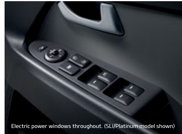
Electric power windows throughout. (SLi/Platinum model shown)