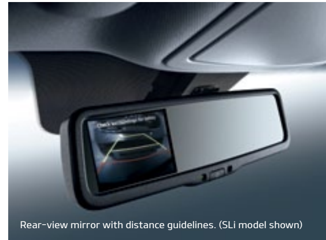
Rear-view mirror with distance guidelines. (SLi model shown)