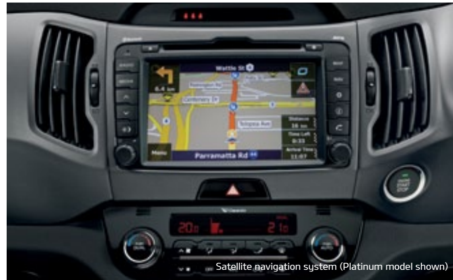
Satellite navigation system (Platinum model shown)