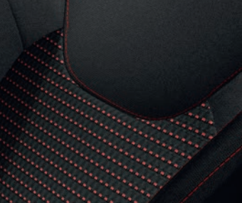
DARK CARBON UPHOLSTERY