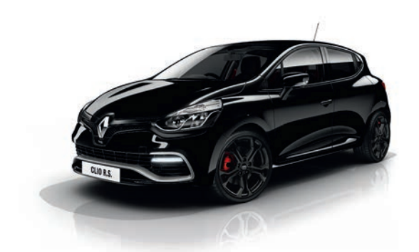
DEEP BLACK (GNA) M