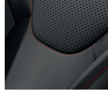
DARK CARBON LEATHER SEATS