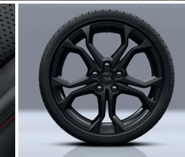
18" RADICALE ALLOYS^