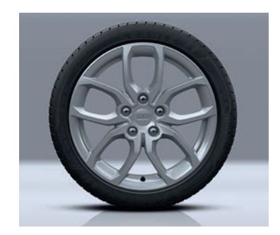
17" TIBOR ALLOYS*