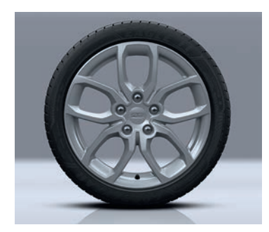
17" TIBOR ALLOYS*