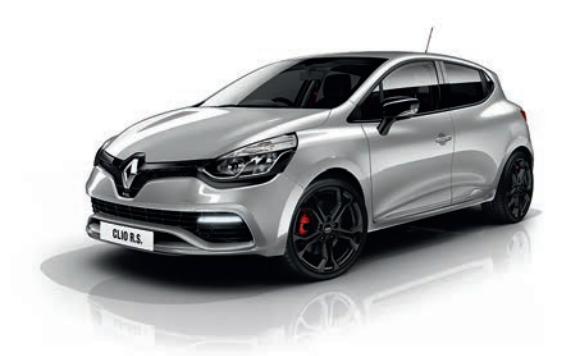
MERCURY GREY (D69) M