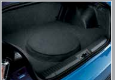
BOOT/SPARE WHEEL CARPET MAT