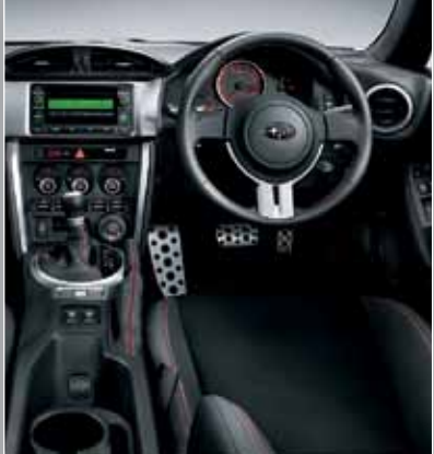
OPTIONAL: HEATED DRIVER AND FRONT PASSENGER SEATS