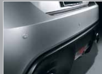
REAR PARK ASSIST KIT