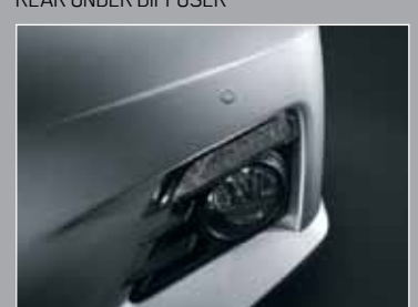
FRONT CORNER ASSIST<sup>2</sup>