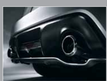
REAR UNDER DIFFUSER