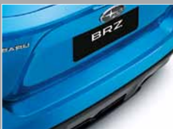
REAR BUMPER APPLIQUE