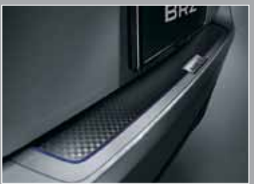
REAR STEP PANEL