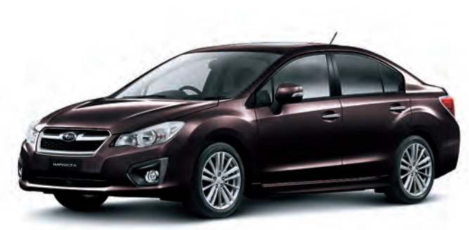
DEEP CHERRY PEARL