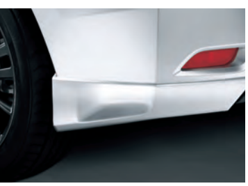
AERO MUDFLAP - REAR (IMPREZA 2.0i-S ONLY)