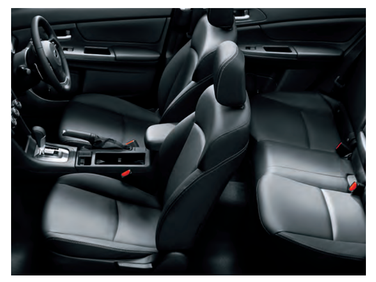
OPTION PACK: LEATHER<sup>1</sup> BLACK OR IVORY: IMPREZA 2.0i-S