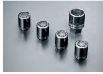
WHEEL LOCK NUTS