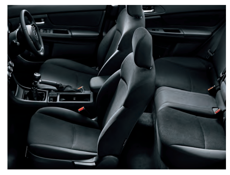
CLOTH: BLACK: IMPREZA 2.0i, IMPREZA 2.0i-L AND IMPREZA 2.0i-S IVORY: IMPREZA 2.0i AND IMPREZA 2.0i-L