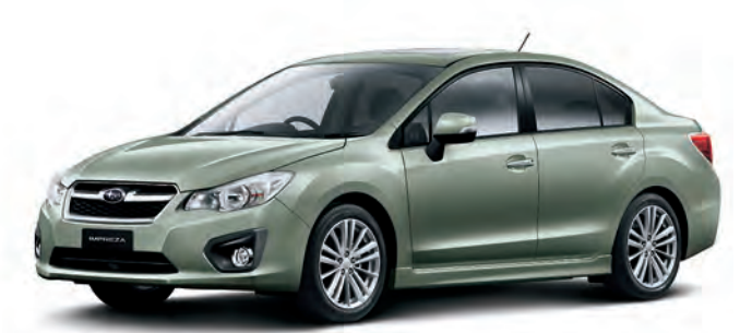
JASMINE GREEN METALLIC<sup>1</sup>