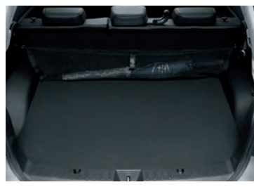
CARGO NET (REAR SEAT BACK)