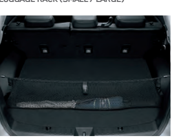
CARGO NET (REAR TAILGATE)