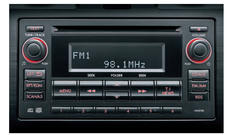
SINGLE IN-DASH CD PLAYER: IMPREZA 2.0i, IMPREZA 2.0i-L AND IMPREZA 2.0i-S 1. Some parts of seating are not full natural leather.