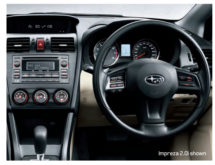
MULTI-INFORMATION DISPLAY: IMPREZA 2.0i