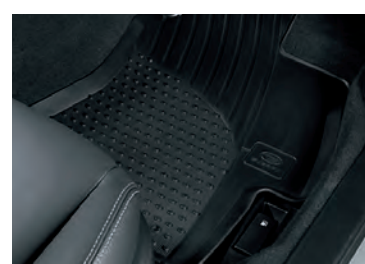
RUBBER MAT SET