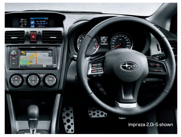
MULTI-FUNCTION DISPLAY UNIT (MFD): IMPREZA 2.0i-L AND IMPREZA 2.0i-S