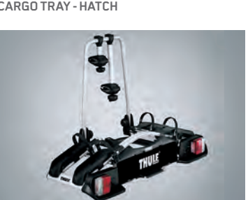
TOW BALL MOUNTED BIKE CARRIER (TWO BIKES)