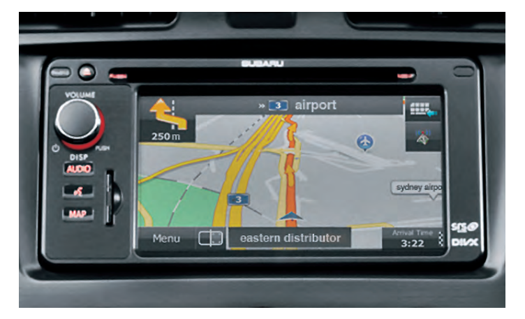
MULTI-INFORMATION IN-DASH SATELLITE NAVIGATION SYSTEM: OPTION PACK FOR IMPREZA 2.0i-L AND IMPREZA 2.0i-S