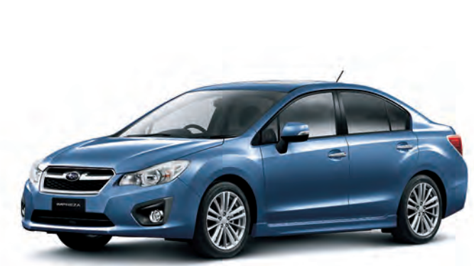
MARINE BLUE PEARL