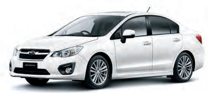
SATIN WHITE PEARL

All colours available in sedan and hatch models.