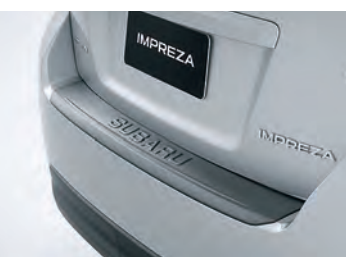
CARGO STEP PANEL - RESIN