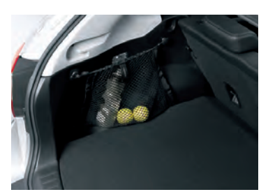
CARGO NET (SIDES)