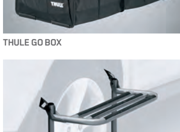
SIDE STEP UP