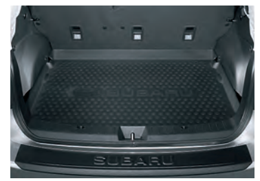
CARGO TRAY - HATCH