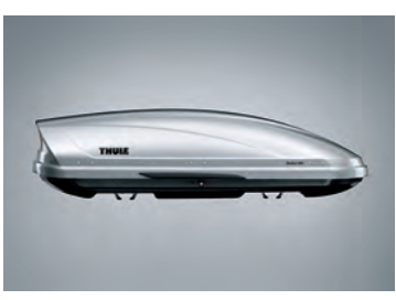
THULE MOTION 200 SILVER LUGGAGE POD