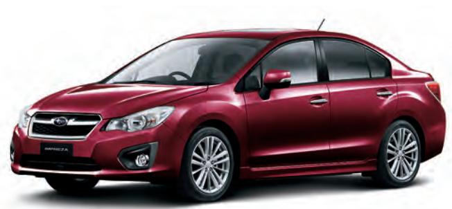
VENETIAN RED PEARL