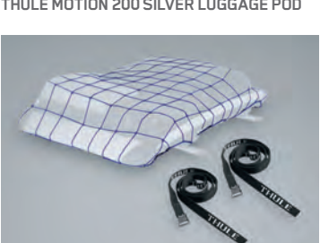
NET AND STRAPS FOR LUGGAGE RACK