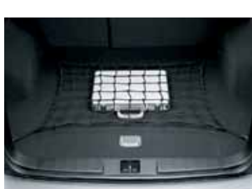
CARGO NET FLOOR