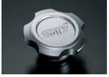
MAGNESIUM OIL FILTER CAP