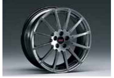
ENKEI ALLOY WHEEL (SILVER 18X7.5)