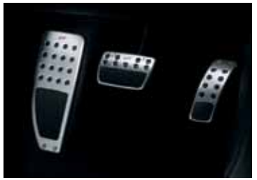
SPORTS PEDAL PAD SET - CVT