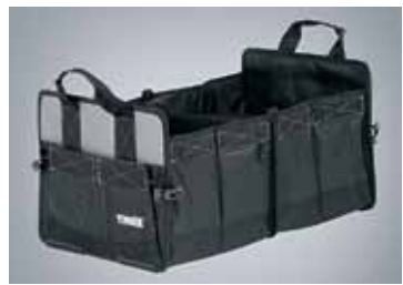
THULE GO BOX