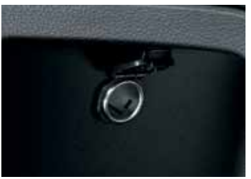
CARGO POWER SOCKET