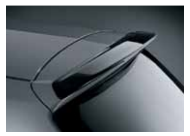
REAR TAILGATE LIP SPOILER - WAGON