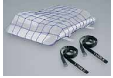
NET AND STRAPS FOR LUGGAGE RACK