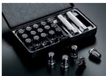
SECURITY WHEEL NUT SET