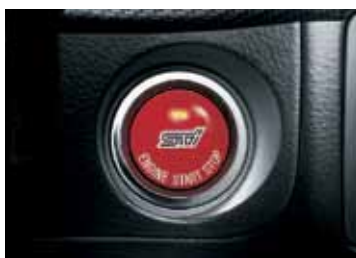
PUSH START SWITCH