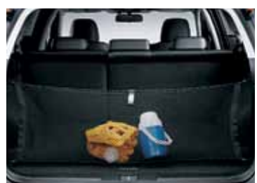
CARGO NET (REAR)