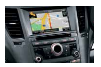
MULTI-INFORMATION IN-DASH SATELLITE NAVIGATION SYSTEM: Liberty 2.5i (with Option Pack) and Liberty 2.5i Premium.