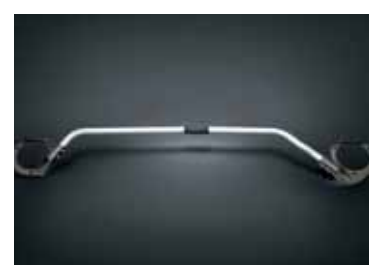
FLEXIBLE TOWER BAR