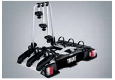
TOWBALL MOUNTED BIKE CARRIER (THREE BIKES)