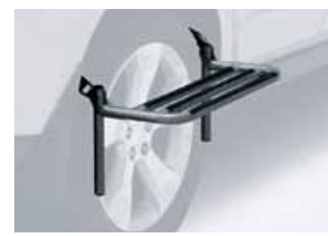
SIDE STEP UP