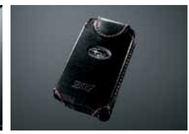
LEATHER KEYLESS REMOTE CASE