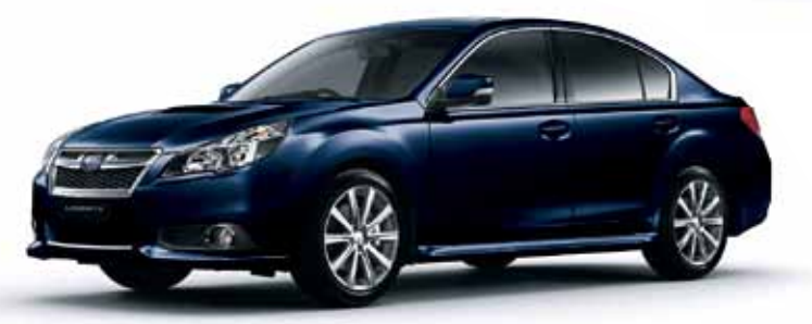
DEEP SEA BLUE PEARL