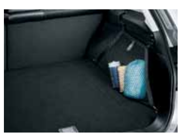
CARGO NET (SIDE x2)