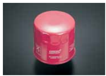
COMPETITION OIL FILTER