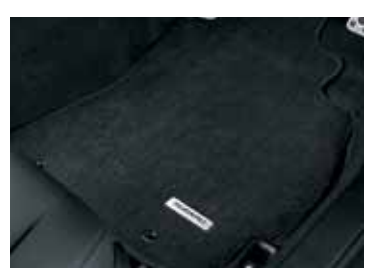
CARPET FLOOR MATS