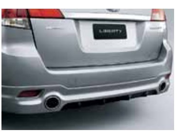
REAR BUMPER SKIRT