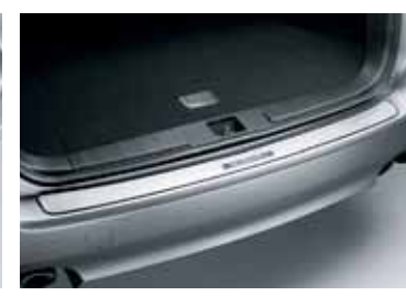
REAR STEP PANEL (STAINLESS)