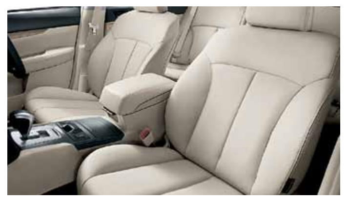
IVORY: Cloth: Liberty 2.5i Leather<sup>1</sup>: Liberty 2.5i (with Option Pack), Liberty 2.5X and Liberty 3.6X