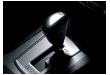
ALUMINIUM AND LEATHER GEAR KNOB - AT