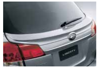
WAIST SPOILER - WAGON