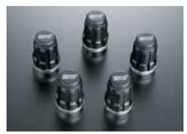
WHEEL LOCK NUTS (BLACK)