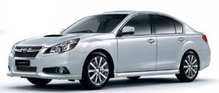
ICE SILVER METALLIC