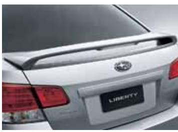
BOOT SPOILER - SEDAN