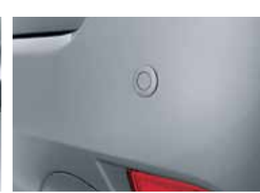
REAR PARK ASSIST