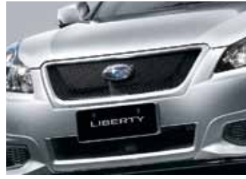
FRONT GRILLE (EXPANDED METAL)