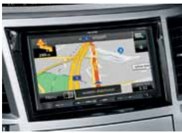
AVN NAVIGATION SYSTEM