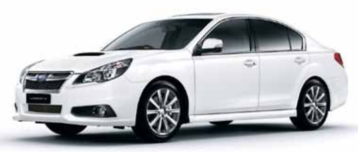
SATIN WHITE PEARL

All colours available in sedan and wagon models.