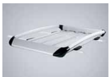
LUGGAGE RACK (LARGE)