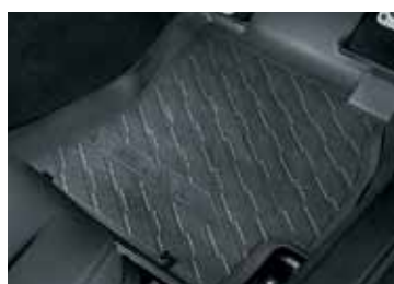
RUBBER FLOOR MATS