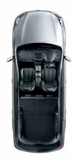
MODELS SHOWN: Liberty 2.5 GT Premium - sedan left, wagon middle and right.