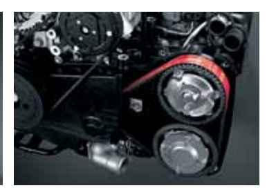
SHORT SHIFT GEAR LEVER ASSEMBLY - 6MT COMPETITION TIMING BELT