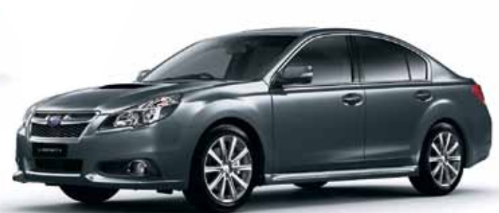
DARK GREY METALLIC