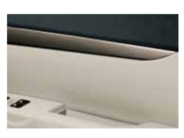
TITANIUM DRAPE: Liberty 3.6X