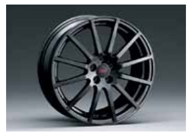
ENKEI ALLOY WHEEL (CHARCOAL 17X7.5)