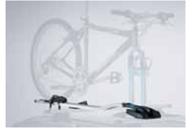
BICYCLE HOLDER (FORK MOUNT)