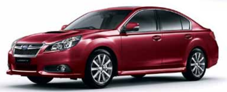
VENETIAN RED PEARL