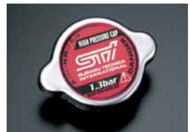
HIGH PRESSURE RADIATOR CAP