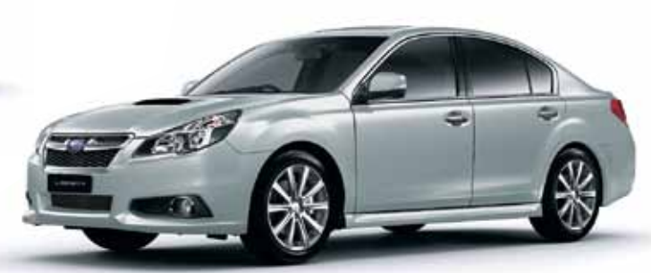
SAGE GREEN METALLIC