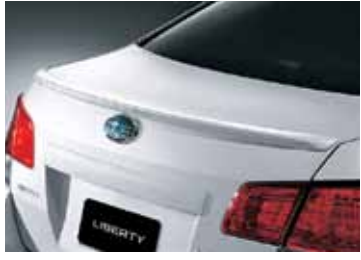
REAR BOOT LIP SPOILER - SEDAN