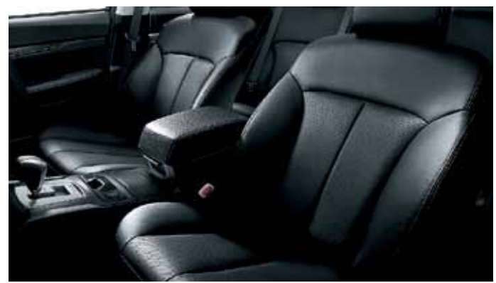
BLACK: Cloth: Liberty 2.5i Leather<sup>1</sup>: Liberty 2.5i (with Option Pack), Liberty 2.5i Premium, Liberty 2.5X, Liberty 2.5 GT Premium and Liberty 3.6X