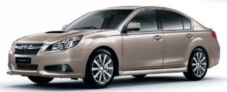
BURNISHED BRONZE METALLIC