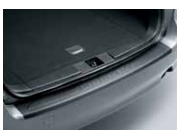
REAR STEP PANEL (RESIN)