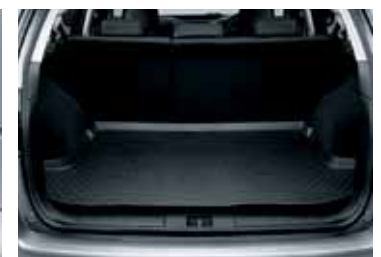
CARGO TRAY (LOW DISH)