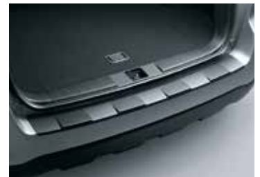
REAR STEP PANEL (RESIN)