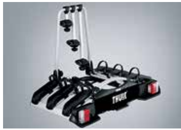
TOWBALL MOUNTED BIKE CARRIER (THREE BIKES)