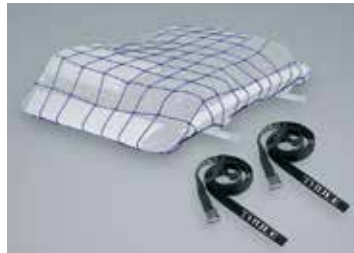
NET AND STRAPS FOR LUGGAGE RACK