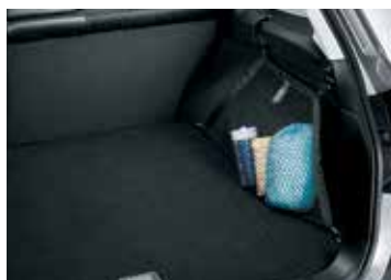
CARGO NET (SIDE x2)