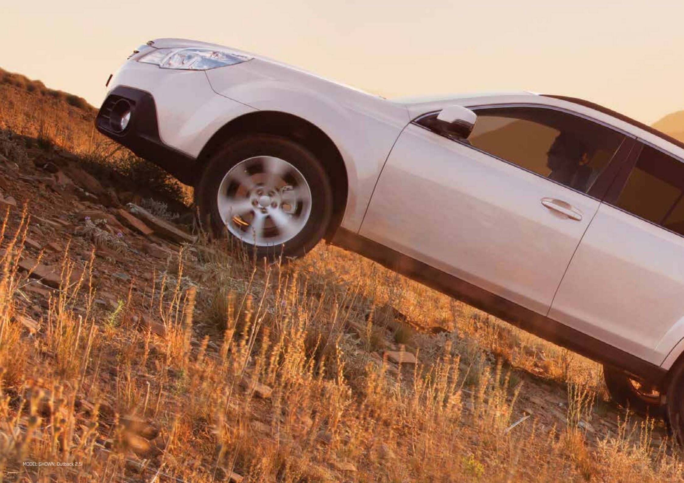
MODEL SHOWN: Outback 2.5i