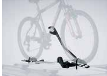
BICYCLE HOLDER (UPRIGHT)