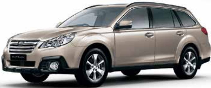
BURNISHED BRONZE METALLIC