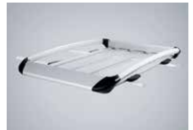
LUGGAGE RACK (LARGE)