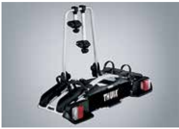
TOWBALL MOUNTED BIKE CARRIER (TWO BIKES)