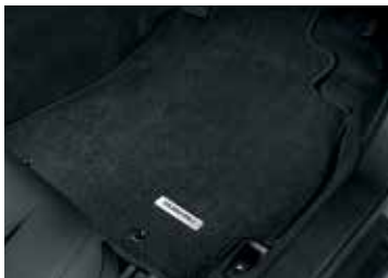
CARPET FLOOR MAT