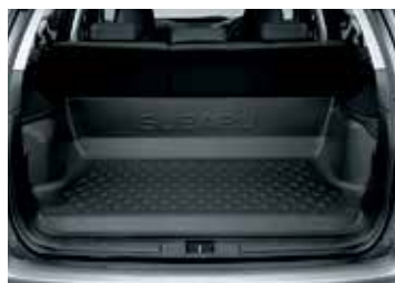
CARGO TRAY (DEEP DISH)