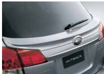
REAR WAIST SPOILER