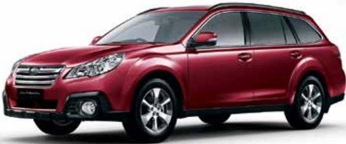
VENETIAN RED PEARL