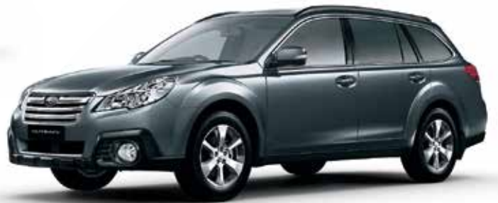
DARK GREY METALLIC