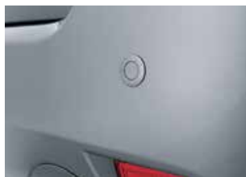
REAR PARK ASSIST