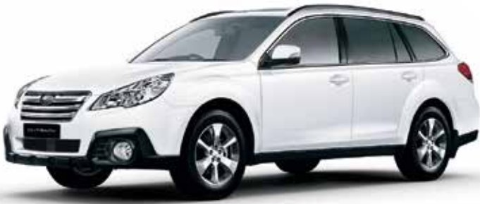
SATIN WHITE PEARL

Always check with your authorised Subaru Retailer regarding colour availability of your selected model before purchase.