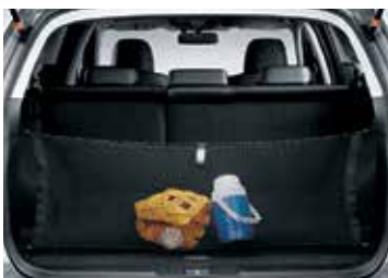
CARGO NET (REAR)