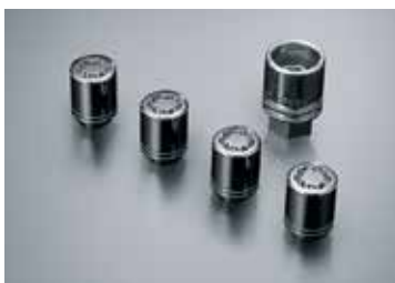
WHEEL LOCK NUTS