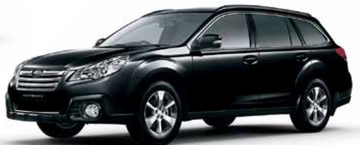
CRYSTAL BLACK SILICA