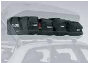
THULE GO PACK SET