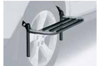
SIDE STEP UP