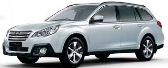
ICE SILVER METALLIC