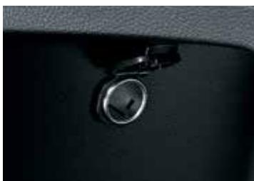
CARGO POWER SOCKET