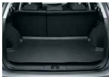
CARGO TRAY (LOW DISH)