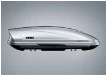
THULE MOTION 200 SILVER LUGGAGE POD