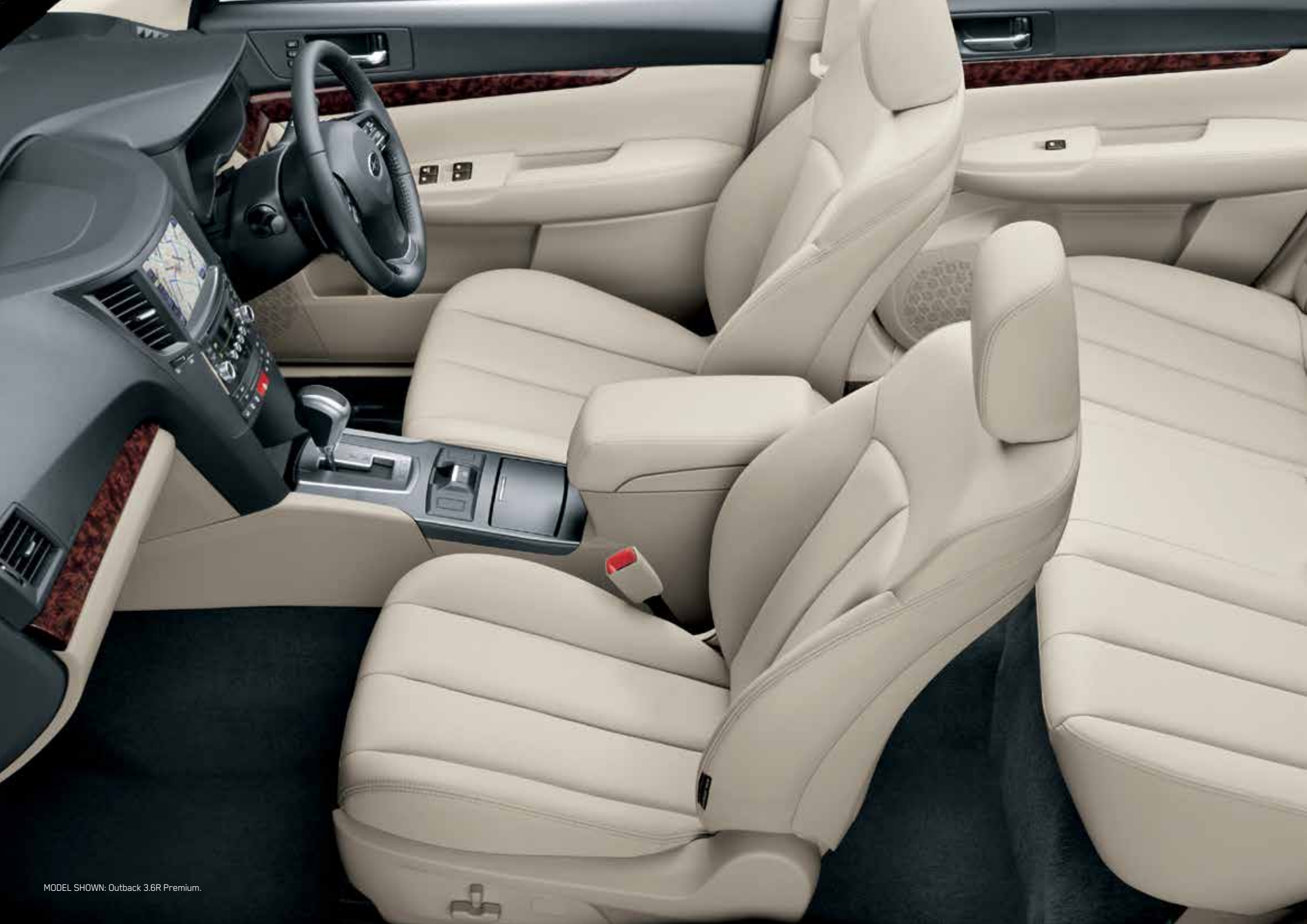
MODEL SHOWN: Outback 3.6R Premium.