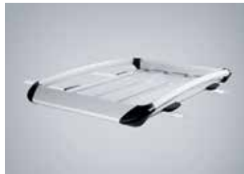
LUGGAGE RACK (SMALL)