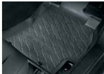
RUBBER FLOOR MAT