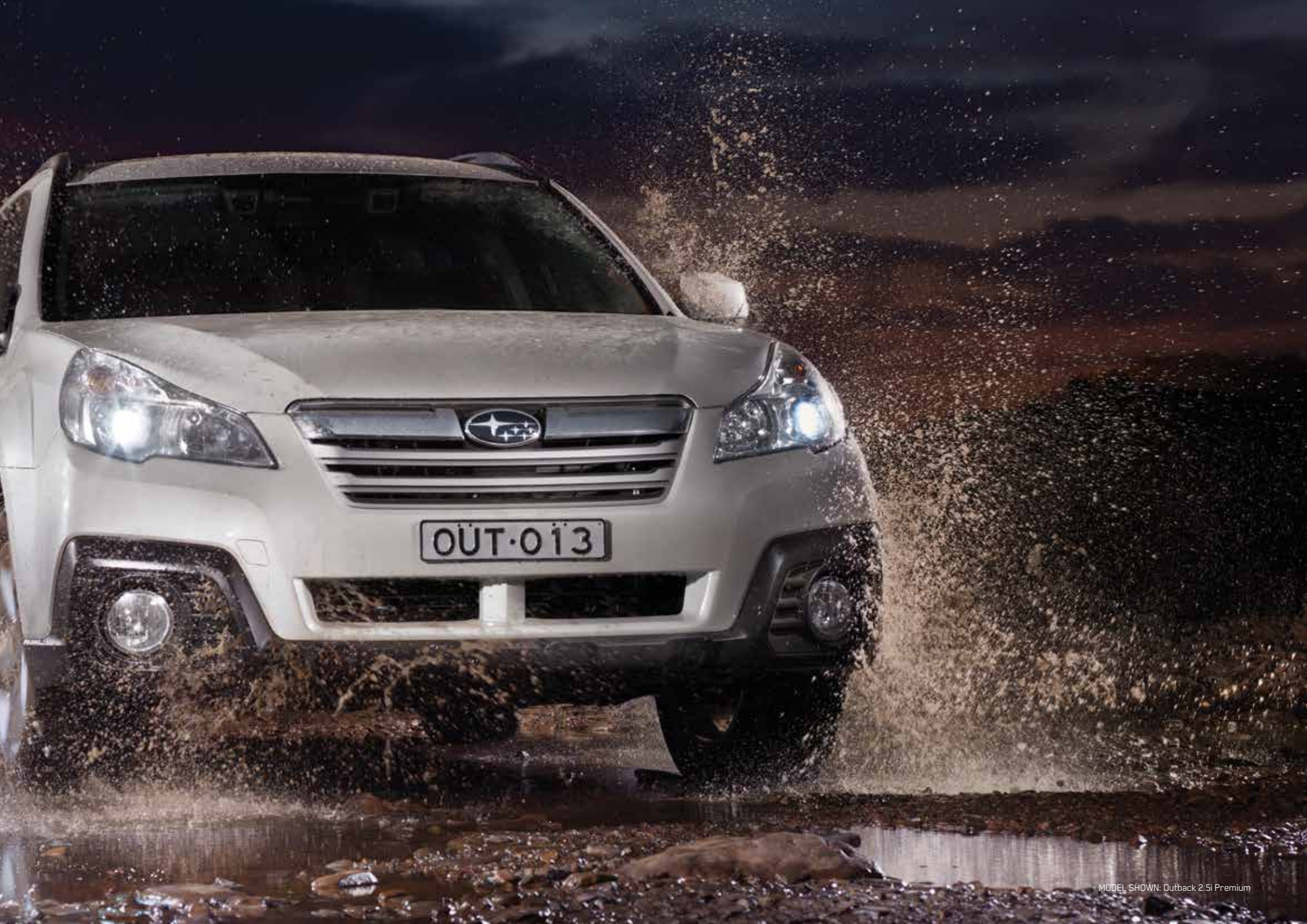
MODEL SHOWN: Outback 2.5i Premium