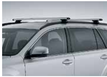
ROOF CROSS BARS