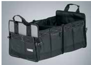
THULE GO BOX