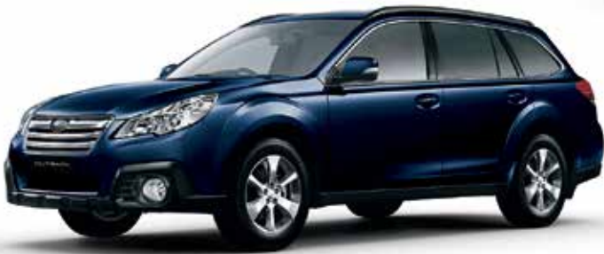
DEEP SEA BLUE PEARL