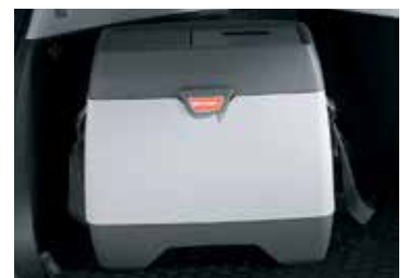
ADVENTURE PORTABLE FRIDGE (14 LITRE, 12V ONLY)