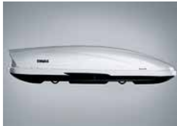
THULE MOTION 800 SILVER LUGGAGE POD