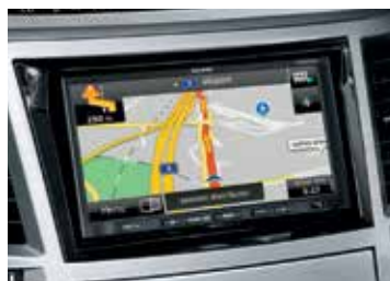
AVN NAVIGATION SYSTEM