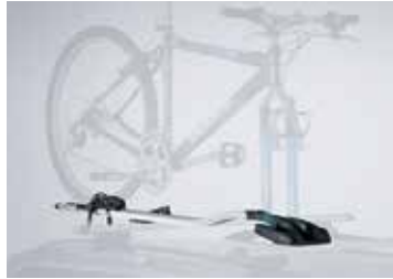
BICYCLE HOLDER (FORK MOUNTED)