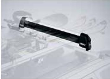
UNIVERSAL LOCKING ARMS