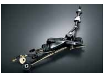
ALUMINIUM AND LEATHER GEAR KNOB - 6MT SHORT SHIFT GEAR LEVER ASSEMBLY - 6MT CARBON FIBRE DESIGN MIRROR COVER