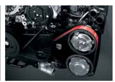
COMPETITION TIMING BELT