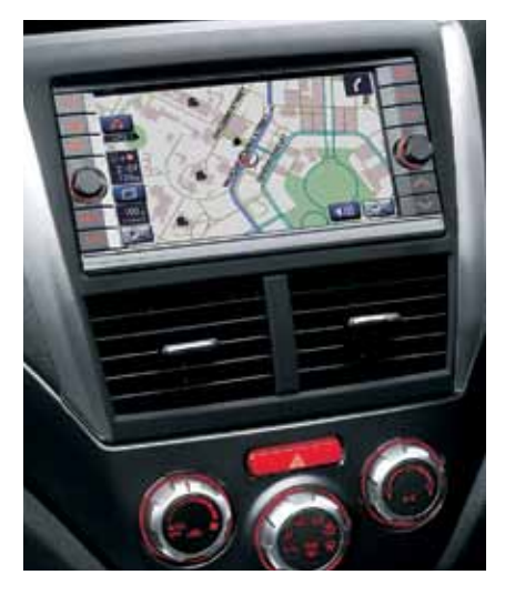
MULTI-INFORMATION IN-DASH SATELLITE NAVIGATION SYSTEM: SUBARU WRX STI SPEC.R