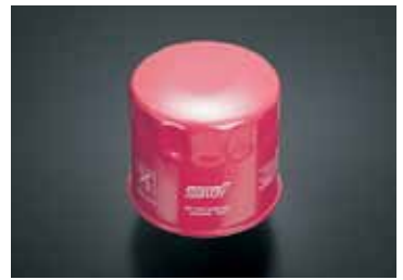
COMPETITION OIL FILTER