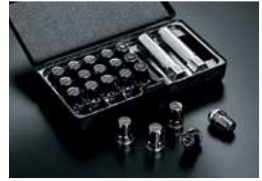
SECURITY WHEEL NUT SET