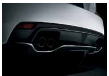
REAR UNDER SPOILER - HATCH