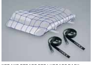
NET AND STRAPS FOR LUGGAGE RACK