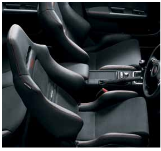
OPTION PACK: RECARO SPORTS BUCKET SEATS: SUBARU WRX STI SPEC.R