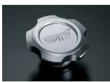
MAGNESIUM OIL FILLER CAP