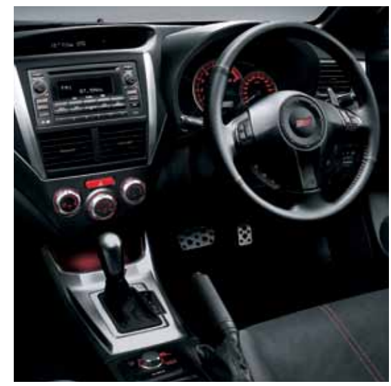
BLACK: ALCANTARA WITH LEATHER¹ ACCENTS SUBARU WRX STI