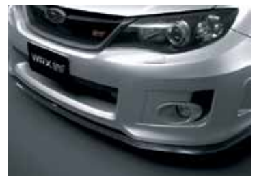
FRONT LIP SPOILER