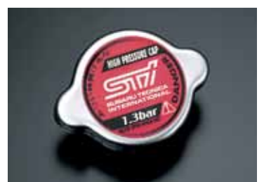
HIGH PRESSURE RADIATOR CAP