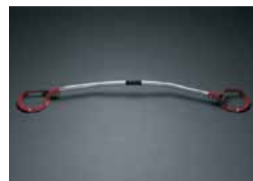
FLEXIBLE TOWER BAR