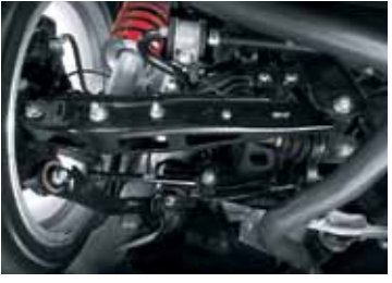
REAR SUSPENSION LINK SET