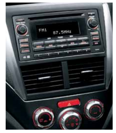
SINGLE IN-DASH CD PLAYER: SUBARU WRX STI