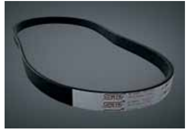
COMPETITION ALTERNATOR/POWER STEERING BELT