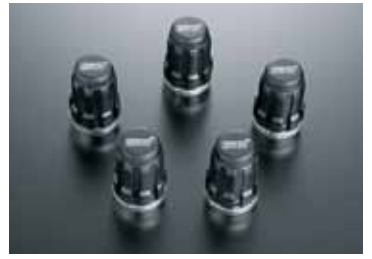
WHEEL LOCK NUTS (BLACK)