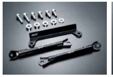
FRONT SUPPORT KIT