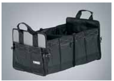
THULE GO BOX