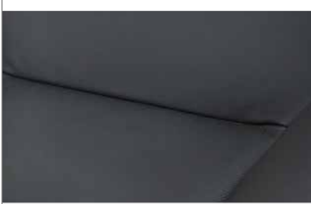
Black leather-appointed seat trim<sup>e</sup> – VTi-L model.