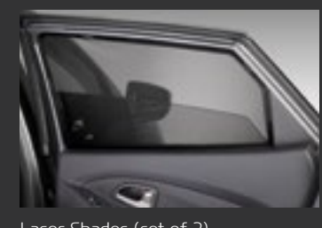
Laser Shades (set of 2)