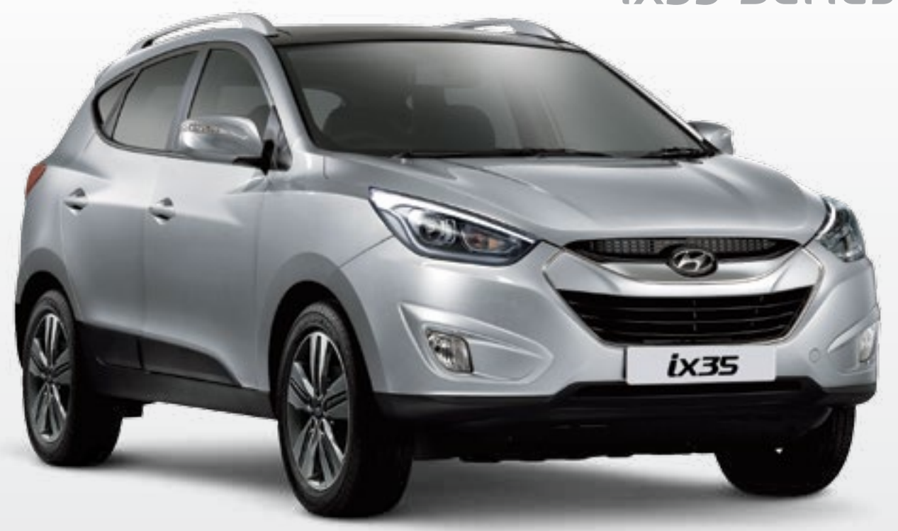
ix35 Highlander model shown in Sleek Silver