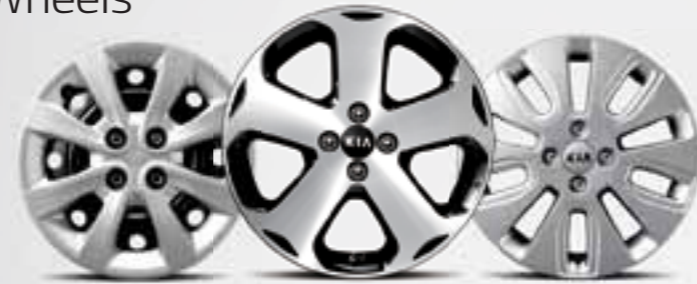
15-inch Steel Wheel (S model)