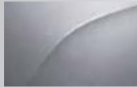
Bright Silver #