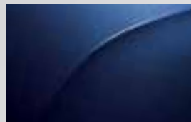
Deep Blue #