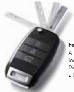
Folding key (S/Si/SLi) A compact device that locks and unlocks the Rio with the touch of a button.

Engineered to be a car with features that are cutting-edge yet effortlessly simple to use, the interior of the Rio is full of intuitive design. With switches positioned for ultimate convenience – such as steering wheel-mounted controls for the audio system and cruise control – you can operate numerous controls without having to take your hands from the wheel. What's more, a highly visible supervision cluster incorporates an on-board trip computer, while the steering wheel itself is tilt and telescopically adjustable so that you can find your perfect driving position. (Si/SLi/SLS)