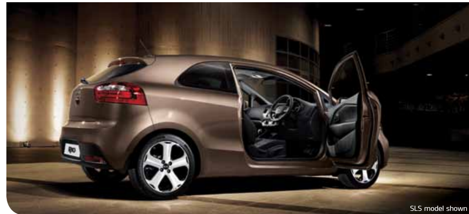
SLS model shown

Designed by Europe's finest, the Rio means small is no longer cute. The new small is a bantamweight that packs up to 103kW of punch (SLS). The new small is a 6-speed that leaves lesser transmissions for dead. The new small offers a gutsy GDi engine (SLS) that delivers a dynamic and sporty performance. The new small is the Rio.