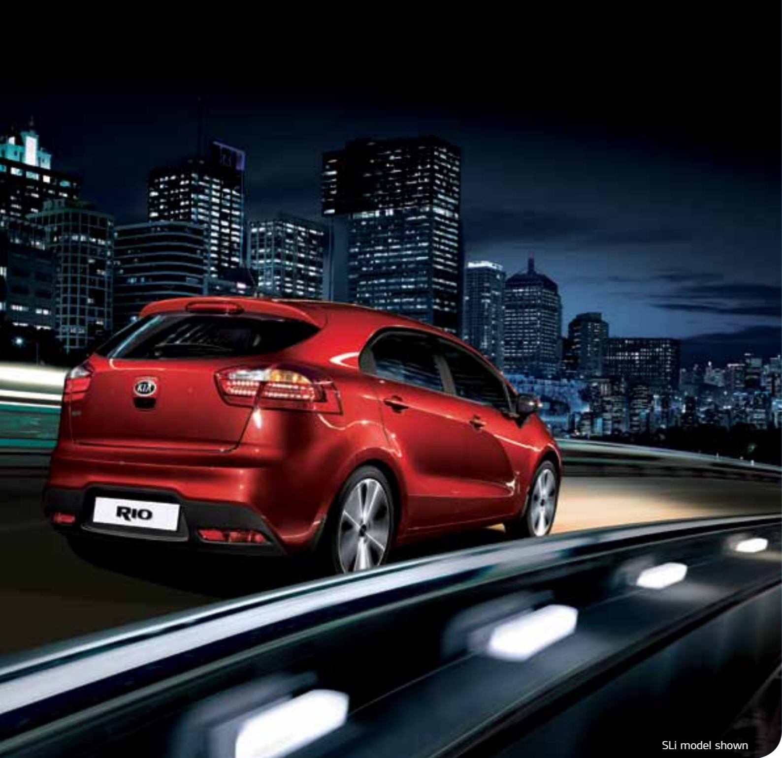
SLi model shown