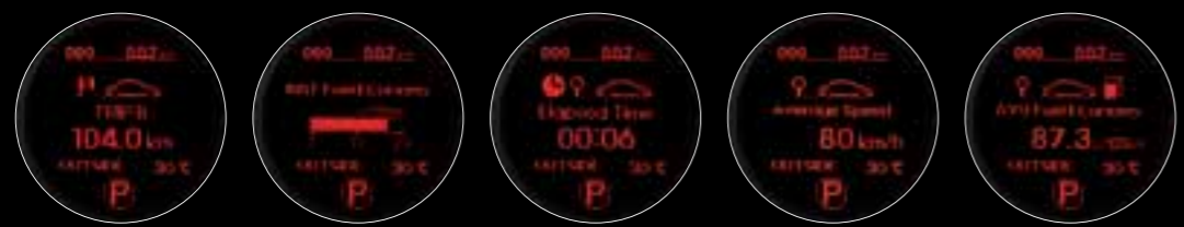
Si/SLi/SLS model shown

The clear, backlit trip computer in the centre of the Rio's high-tech supervision cluster provides essential journey information such as distance to empty and optimum fuel consumption. (Si/SLi/SLS)