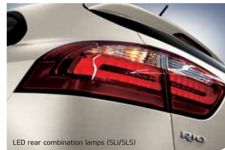
LED rear combination lamps (SLi/SLS)