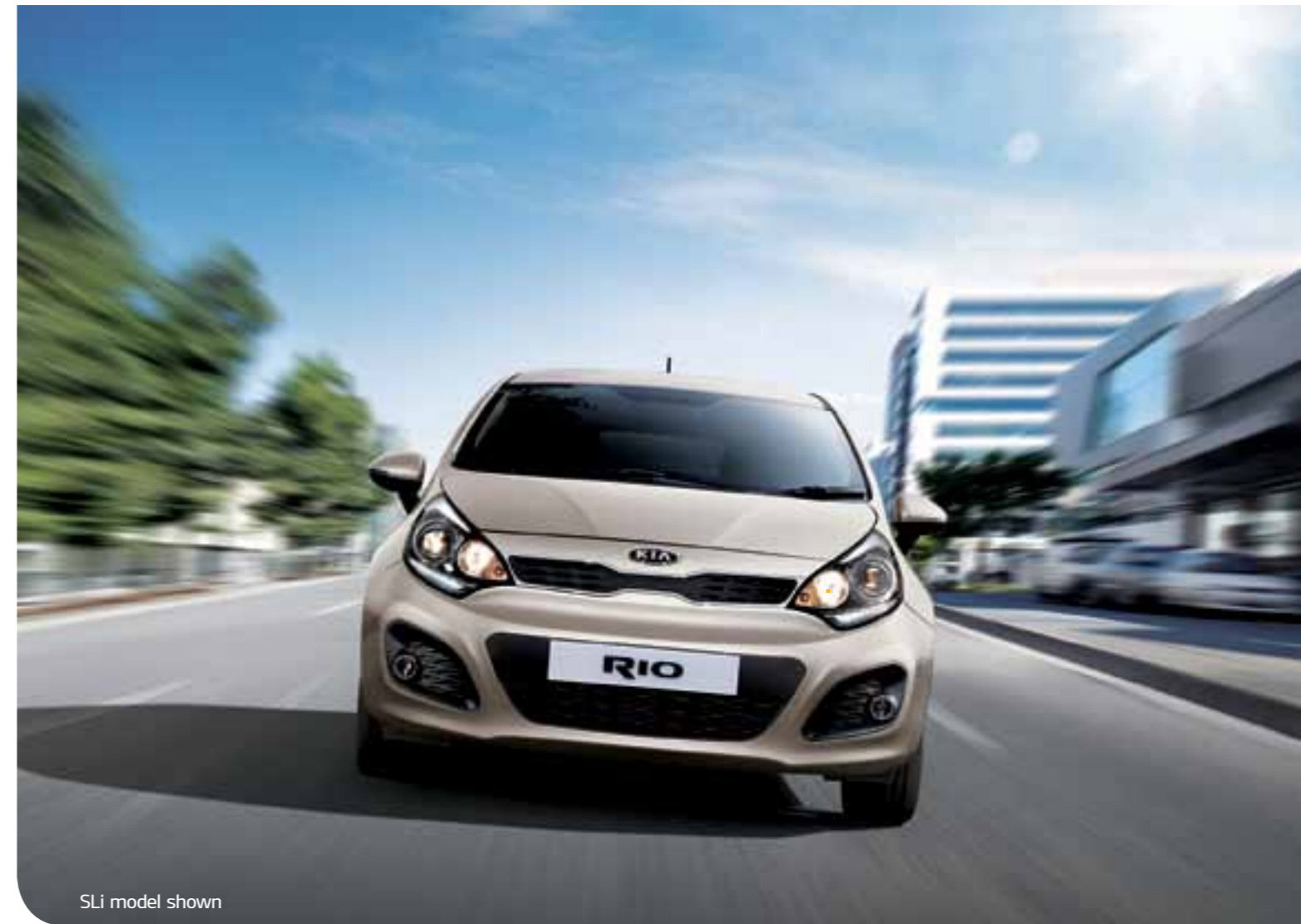
SLi model shown

As you see, what you do on a small scale with your household recycling, we at Kia Motors do on a large scale around the world.