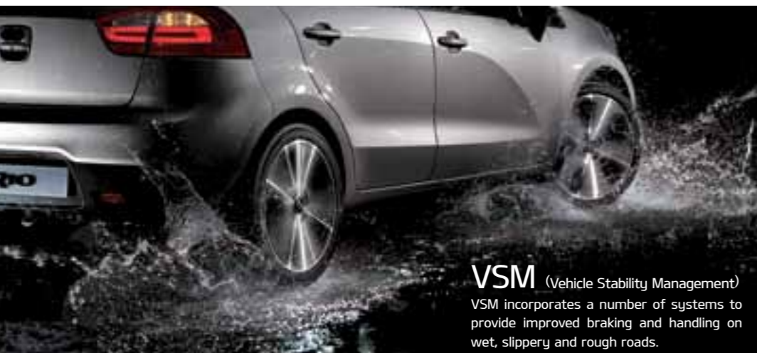
VSM (Vehicle Stability Management) VSM incorporates a number of systems to provide improved braking and handling on wet, slippery and rough roads.

Drive the Rio and along with power, efficiency and performance come low emissions and reduced fuel consumption, not to mention safety specifications of the highest order. From a structural framework that absorbs impact forces in both frontal and side-on collisions to a range of active and passive safety measures, the Rio is built to protect those that matter.