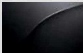
Aurora Black #