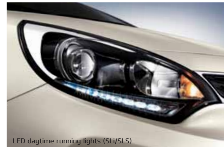
LED daytime running lights (SLi/SLS)