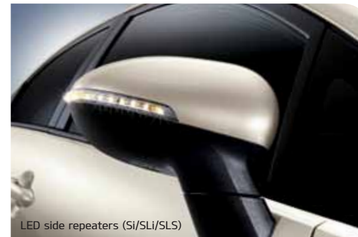
LED side repeaters (Si/SLi/SLS)