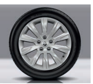
17" FIDJI ALLOY WHEELS