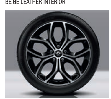
18" TWO TONE SEQUENCE ALLOY WHEELS