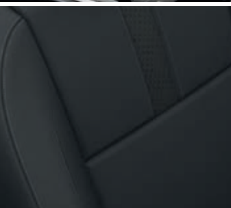
BLACK LEATHER TRIM