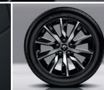
17" TWO TONE BAYADER ALLOY WHEELS