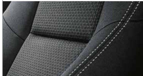
Black fabric seat trim – VTi-S and VTi-L models.