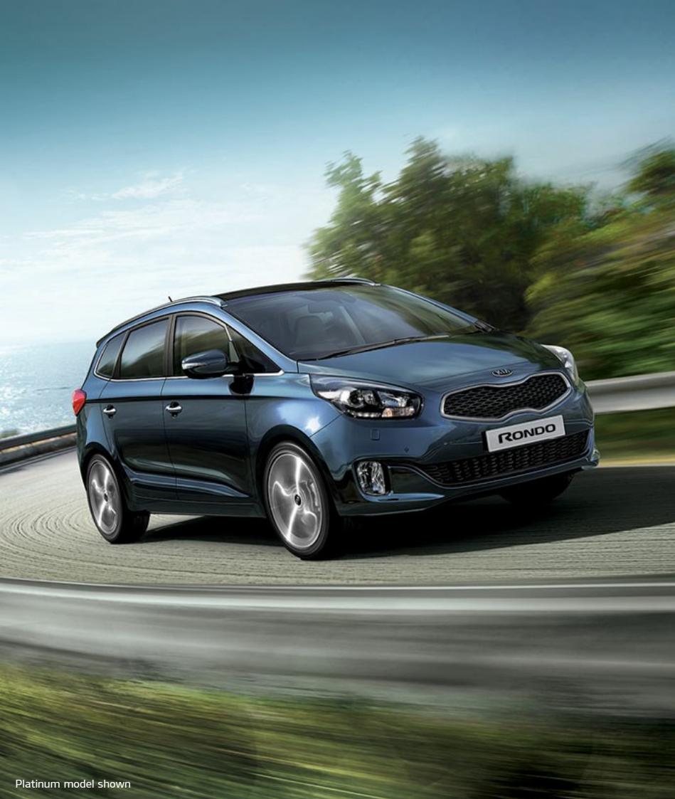
Platinum model shown