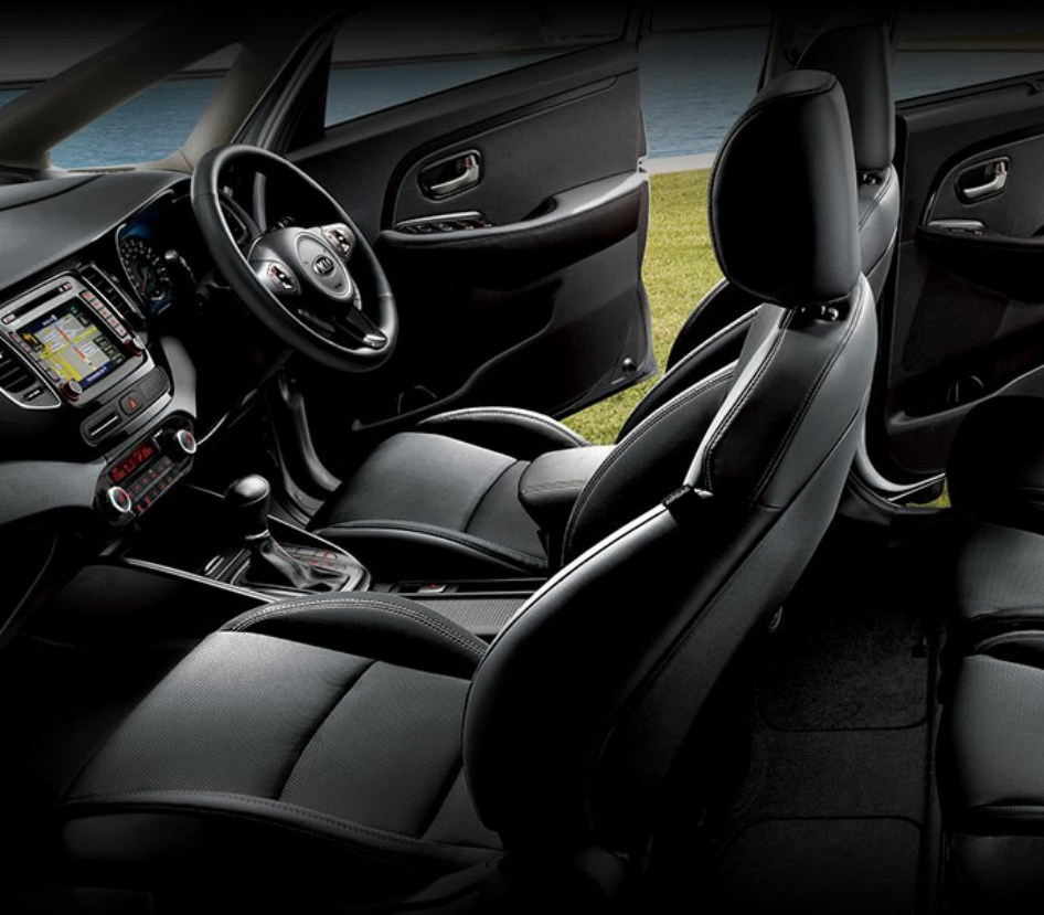
Platinum model shown

Kia's engineers not only succeeded in creating an interior cabin that boasts expansive roominess, but they considered the use of space down to the very last detail. Designed to facilitate active family lifestyles, you'll soon discover why the Rondo is much more than just a People Mover. Details such as the panoramic sunroof are unique, and offer fresh air and sunlight directly into the cabin. (Platinum model only)