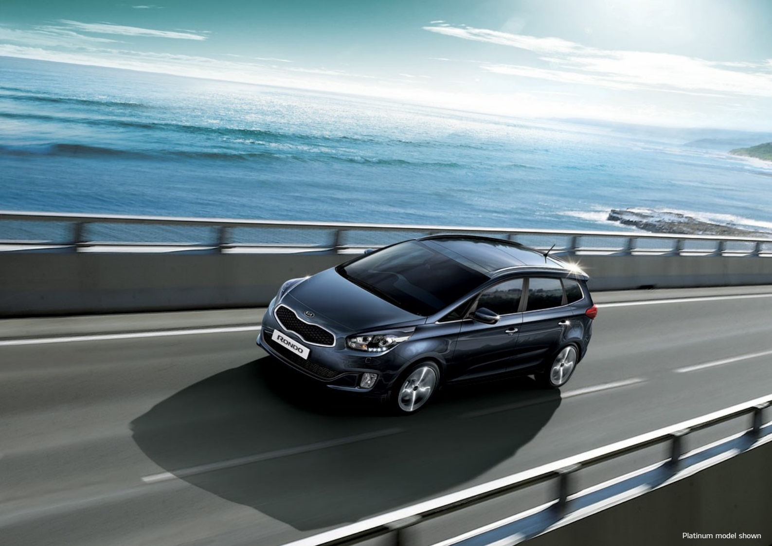
Platinum model shown