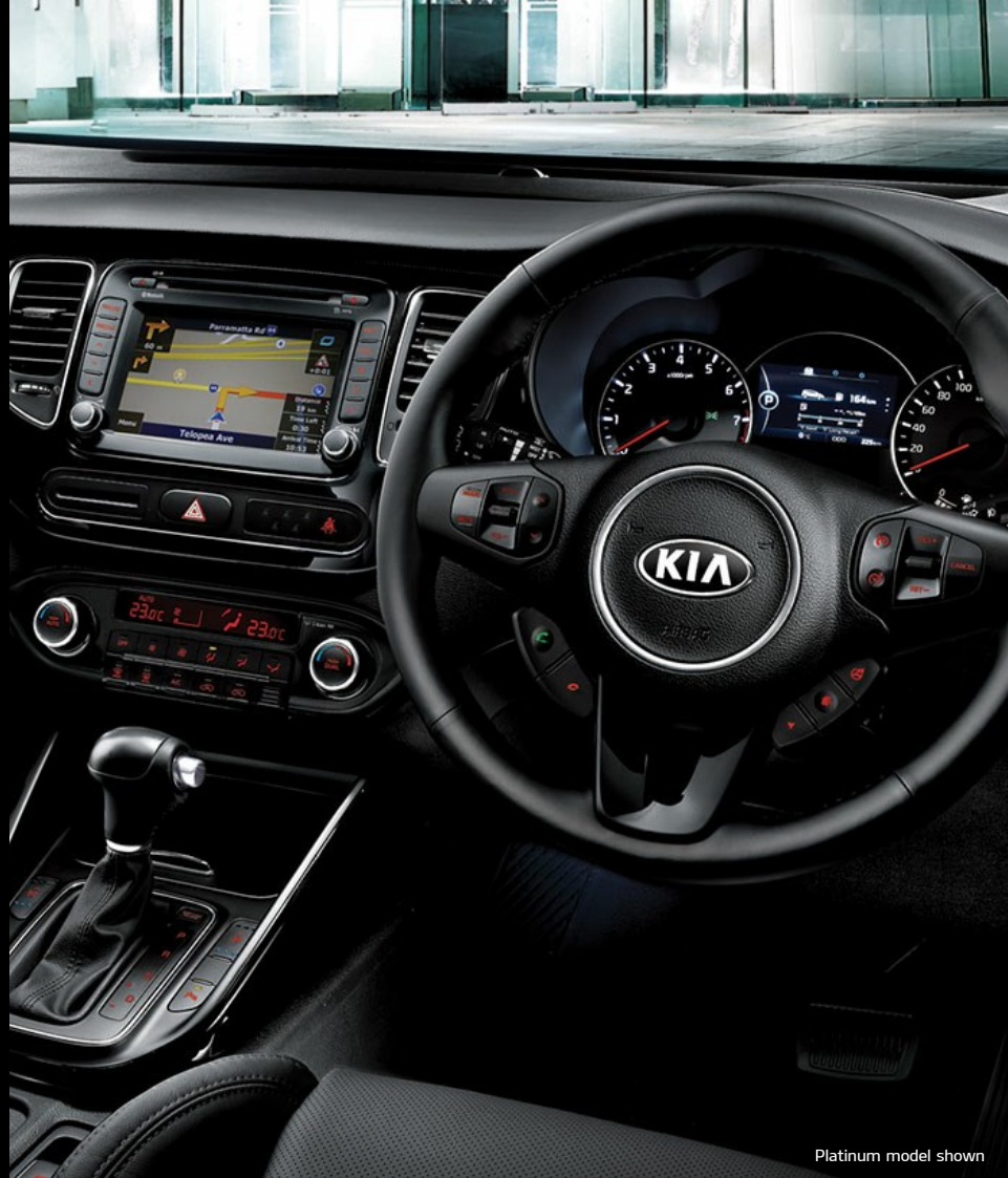
Platinum model shown

A variety of seating configurations allows for 7-seat occupancy through to fully-flat seating, allowing vast cargo storage.