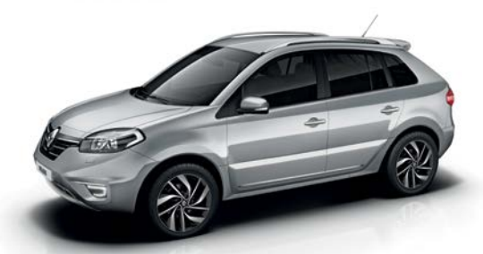
Ultra Silver (KXC) M