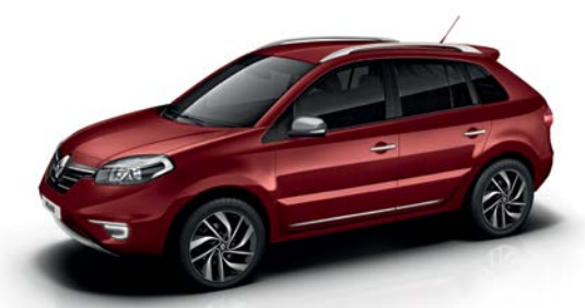
Acerola Red (NAH) M