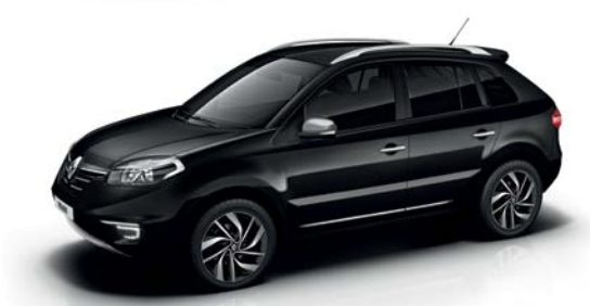
Metallic Black (GXA) M