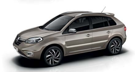
Mineral Beige (HXA) M