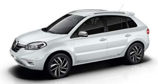
White (QXB) S