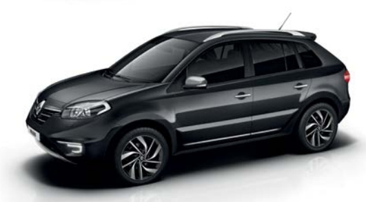
Mars Grey (WXC) M