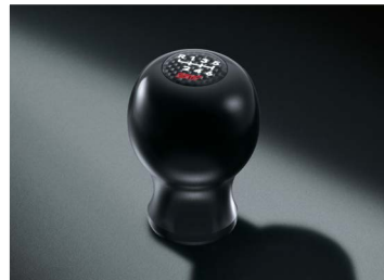
DURACON SHIFT KNOB 6MT 1