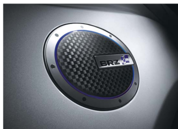
FUEL LID GARNISH