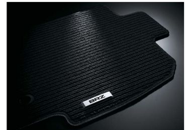
CARPET MAT SET