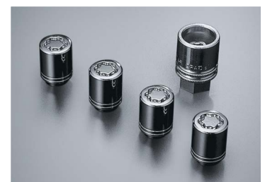
WHEEL LOCK NUTS