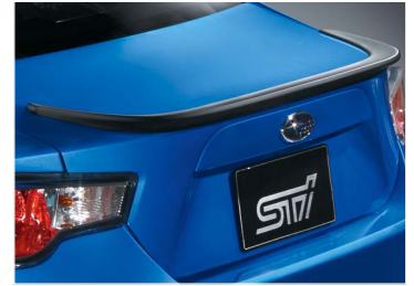
BOOT LIP SPOILER (CRYSTAL BLACK MICA)