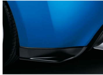
REAR SIDE UNDER SPOILER