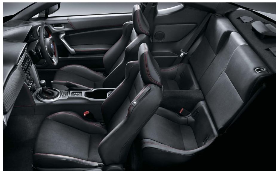
OPTIONAL: LEATHER 1 AND ALCANTARA