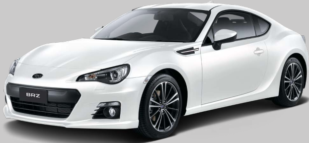
CRYSTAL WHITE PEARL

One of the final choices – but one of the most important! The colour you choose for your Subaru BRZ makes a bold statement about who you are. So we've made sure you've got lots of ways to express yourself – with a wide range of colours to make your Subaru BRZ more... you.