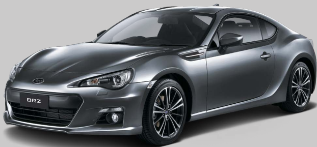
DARK GREY METALLIC