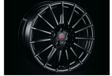
17" ALLOY WHEEL SET - BLACK