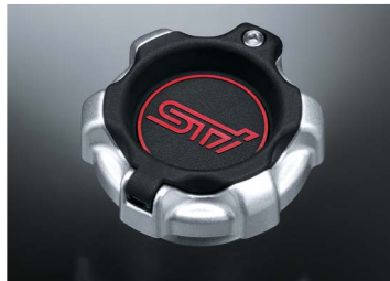
OIL FILLER CAP