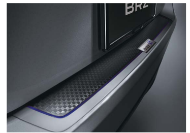
REAR STEP PANEL