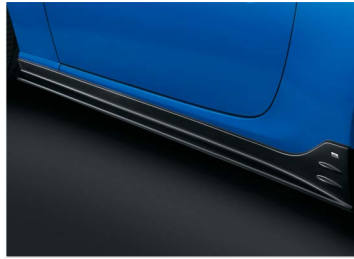
SIDE UNDER SPOILER