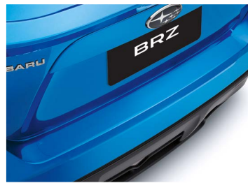
REAR BUMPER APPLIQUE