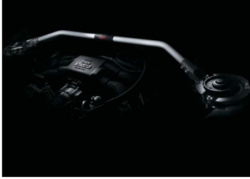
FLEXIBLE STRUT TOWER BAR