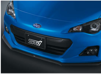
FRONT UNDER SPOILER