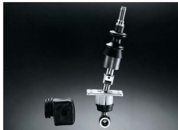
GEARSHIFT LEVER ASSEMBLY KIT 1