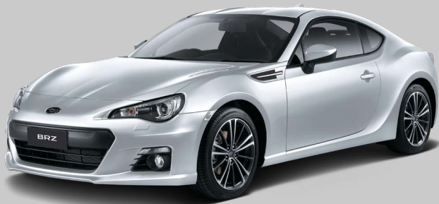
ICE SILVER METALLIC