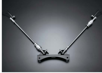
FLEXIBLE DRAW STIFFENER