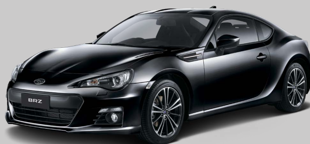
CRYSTAL BLACK SILICA