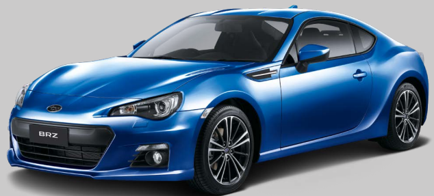
WR BLUE PEARL (Subaru Exclusive)