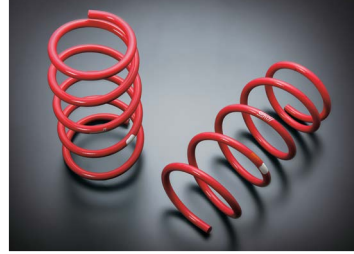
LOWERED COIL SPRING SET