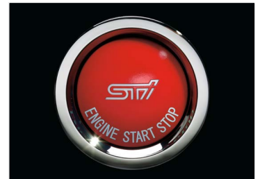
PUSH START ENGINE SWITCH