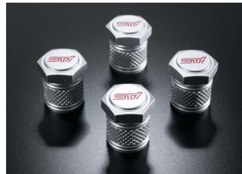
VALVE CAP SET