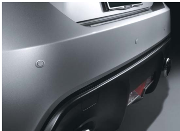
REAR PARK ASSIST KIT