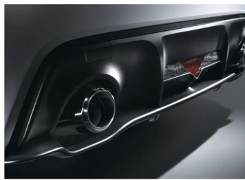
REAR UNDER DIFFUSER