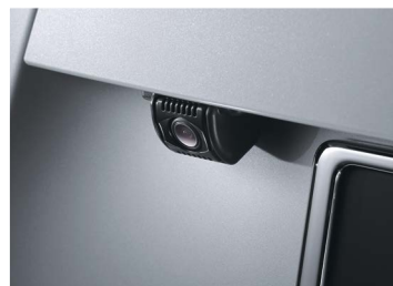
REVERSE CAMERA 3