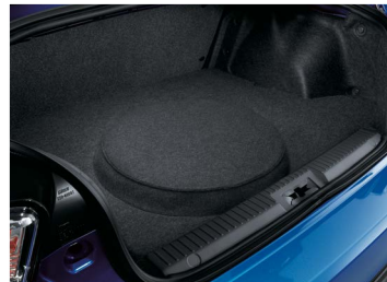
BOOT/SPARE WHEEL CARPET MAT