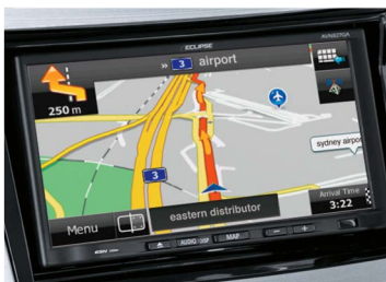
NAVIGATION UNIT 2