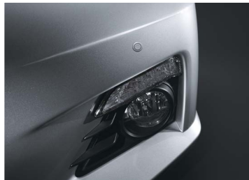
FRONT CORNER ASSIST 1