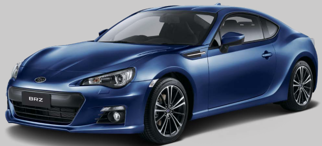
GALAXY BLUE SILICA