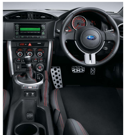
OPTIONAL: HEATED DRIVER AND FRONT PASSENGER SEATS