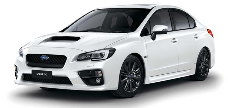
CRYSTAL WHITE PEARL