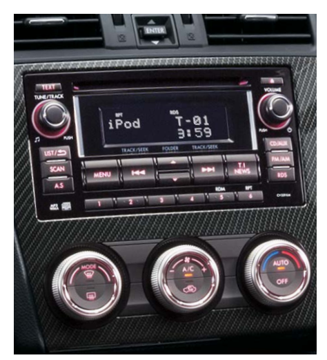
SINGLE IN-DASH CD PLAYER: SUBARU WRX