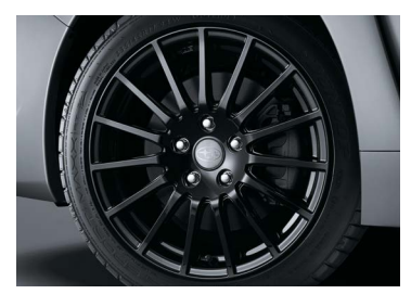
17-INCH ALLOY WHEELS