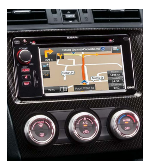
MULTI-INFORMATION IN-DASH SATELLITE NAVIGATION SYSTEM: SUBARU WRX PREMIUM