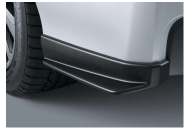
REAR SIDE UNDER SPOILER