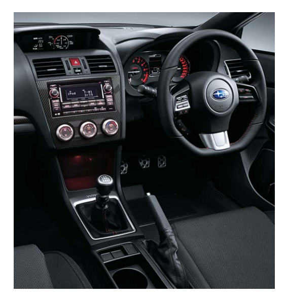
BLACK CLOTH: SUBARU WRX