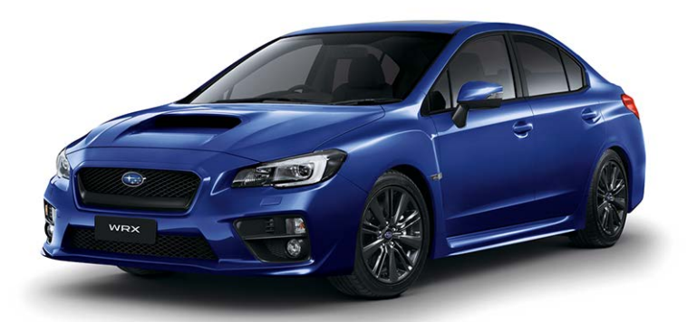
WR BLUE PEARL