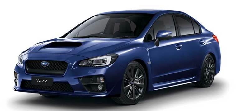
GALAXY BLUE SILICA