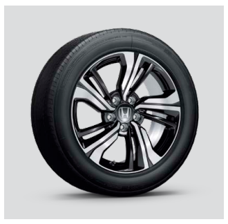
17" alloy sports wheels – RS