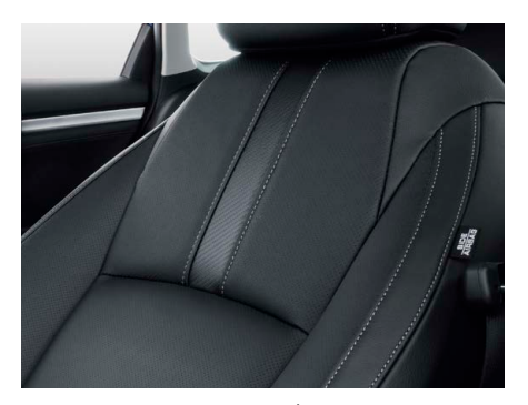
Black leather-appointed seat trim<sup>†</sup> – VTi-LX and RS