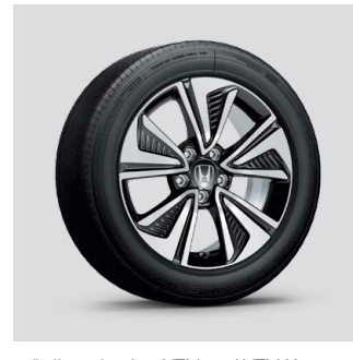
17" alloy wheels - VTi-L and VTi-LX