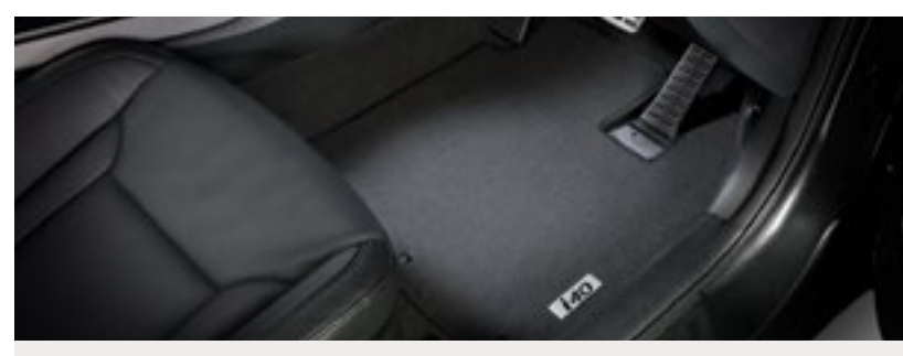
Tailored Carpet Floor Mats (set of 4)