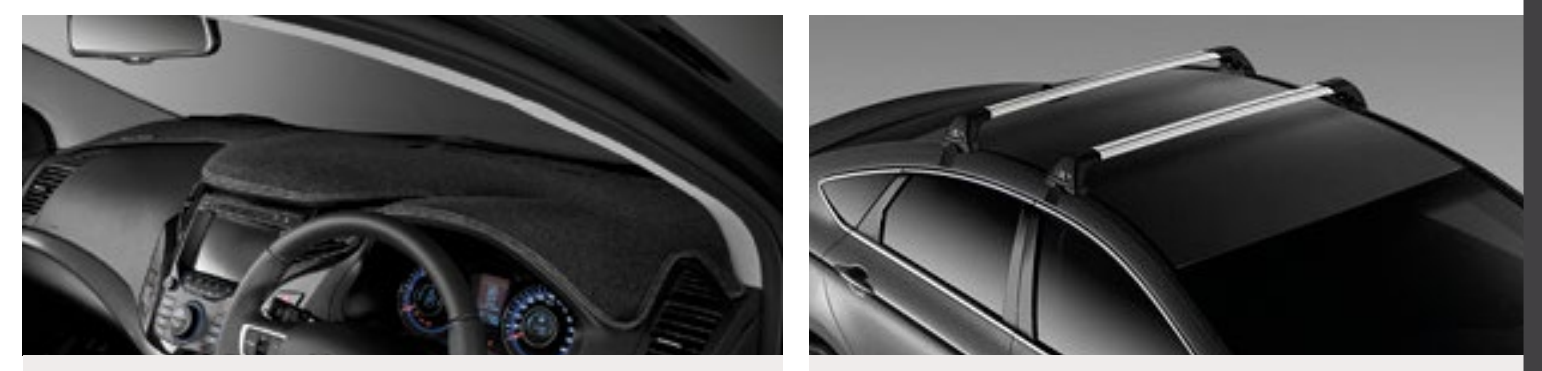
Dash Mat Contoured Colourfast

the screen protector must be fitted to the iPad® when in use. iPad® not included. 2. Only suitable for use with a retractable seatbelt. 3. Please note that mudflaps cannot be fitted in conjunction with a Full BodyKit or Rear Skirt. 4. Maximum Ball Download = 150kg. Towing capacity = 1,500kg braked and 700kg unbraked. Towbar capacity subject to regulatory requirements,