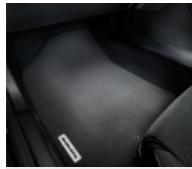
Tailored Carpet Floor Mats (set of 4) Contoured and Colourfast • Driver's side locating clip