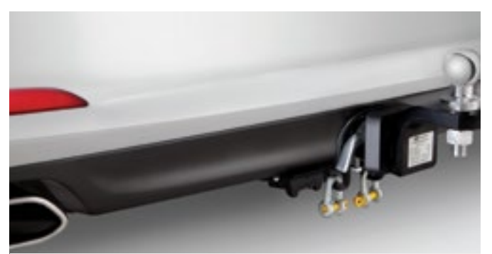
Towbar, Towball and Trailer Wiring Harness<sup>4</sup> Engineered to suit Australian conditions