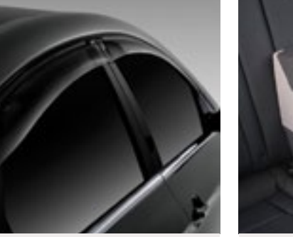
Tinted Stylevisors (set of 4) Reduces fogging without you getting wet Slimline and UV-resistant