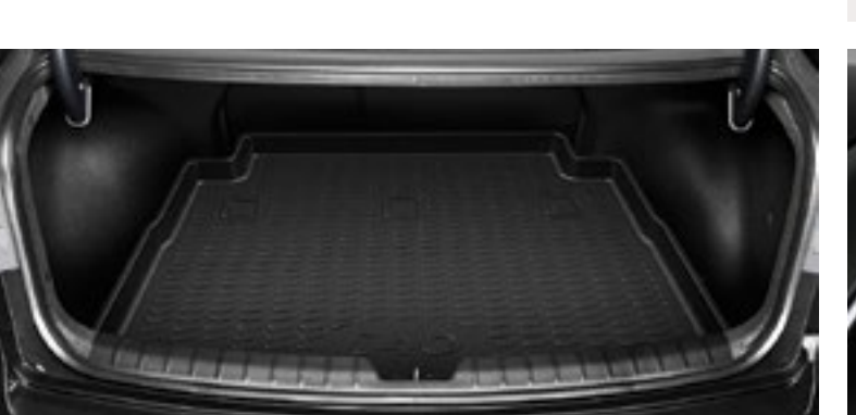
Cargo Liner • Protects your boot • High quality material