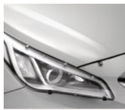
• UV-resistant • Durable