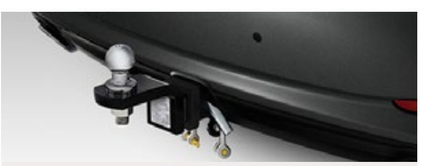
Towbar and Towball<sup>4</sup> • Engineered to suit Australian conditions Trouble-free towing

Thule Bike Rack<sup>6</sup> Secured by a double lock function • Push-button release for easy access