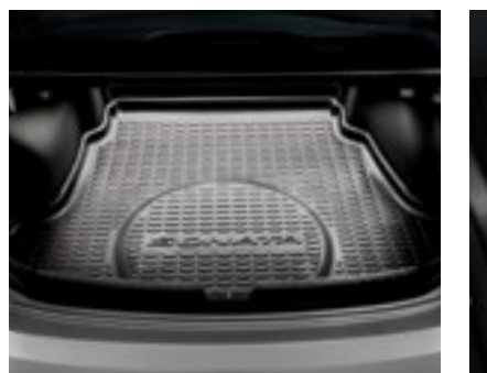
Cargo Liner Protects your boot High quality material