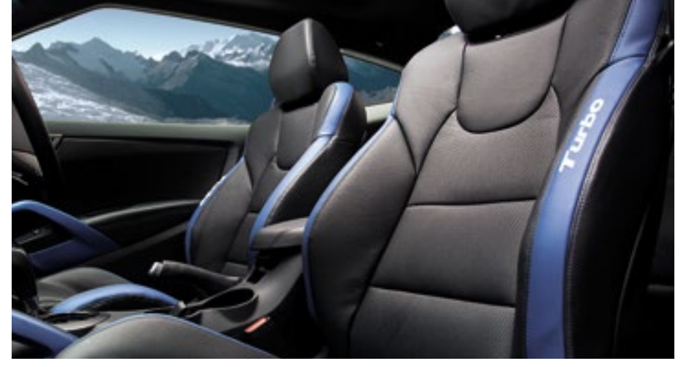
Sports Stule Interio

The Veloster Series II SR Turbo includes bolstered, leather appointed* front sports bucket seats, while 60:40 split folding rear seats increase luggage carrying capacity and allow extra room for unusual shaped items.