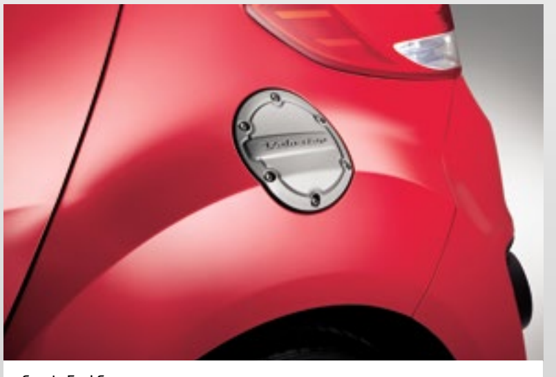
Sports Fuel Cap