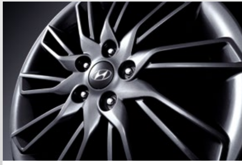
18" Alloy Wheels (Sold separately, tyres not included)