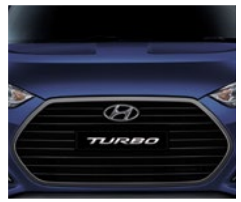
Sports Front Bumper

Set low in the front fascia that frames the widemouthed grille, the round sporty fog lamps enhance near range visibility of the road ahead during difficult weather conditions.