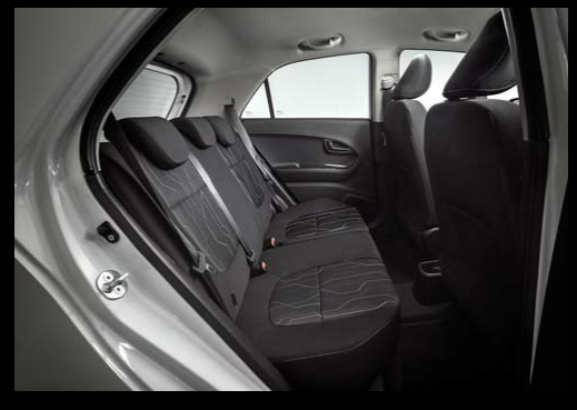
The new Picanto with Auto features a spacious second row with 60/40 split folding rear seats.

Inside the New Picanto with Auto, you'll find a cabin filled with high-quality materials. Satin-silver accents along the dashboard and steering wheel lend to the New Picanto with Auto's stylish nature. Black cloth-trimmed seats offer support and comfort for longer drives. You'll also find Bluetooth connectivity with fingertip steering wheel controls, USB and AUX inputs and a 4-speaker stereo system too.