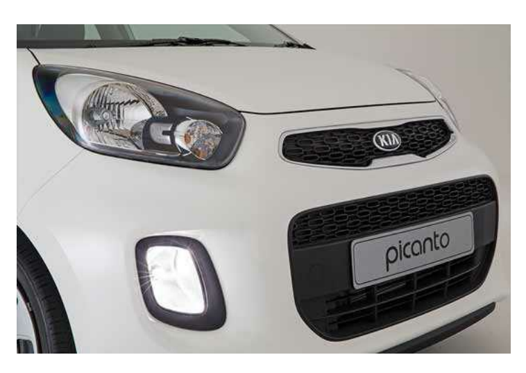
Daytime Running Lights (DRL)

Adjust the settings of the new Picanto with Auto's stereo without taking your eyes off the road.