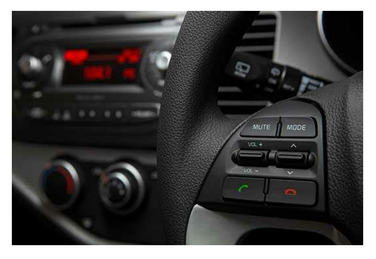
Steering Wheel Audio Controls

Adjust the settings of the new Picanto with Auto's stereo without taking your eyes off the road.