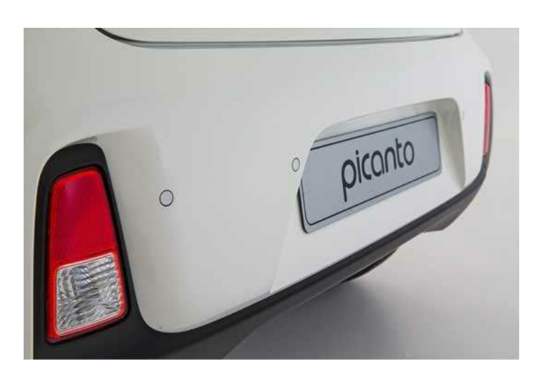
Rear Parking Sensors as Standard

Standard rear parking sensors ensure safer and more convenient reversing.