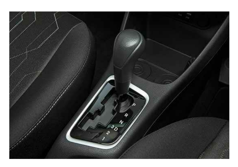
Automatic as Standard

Standard rear parking sensors ensure safer and more convenient reversing.