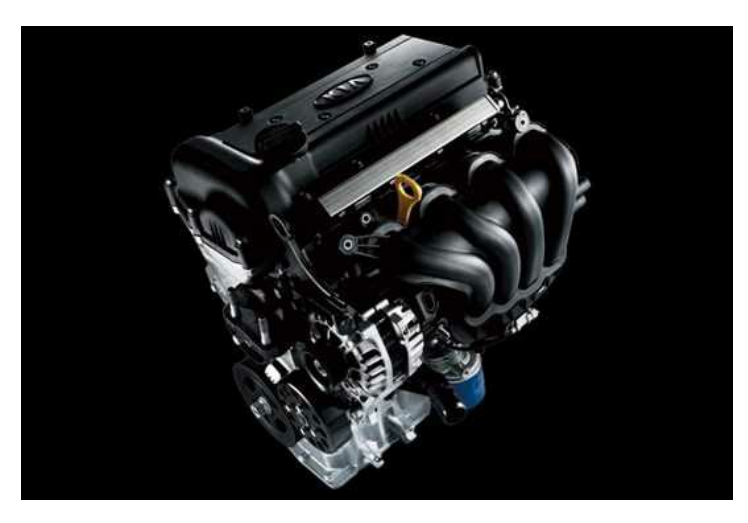
Gamma 1.4L MPi Petrol Engine

An all-new unit that delivers extra power while keeping emissions low, the Rio S and S Premium features our durable and efficient 1.4L petrol engine.