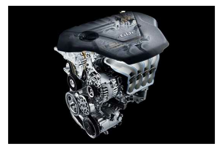
Gamma 1.6L GDi Petrol Engine

An all-new unit that delivers extra power while keeping emissions low, the Rio S and S Premium features our durable and efficient 1.4L petrol engine.