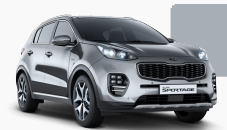
Mineral Silver *