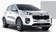
Snow White Pearl ^ *