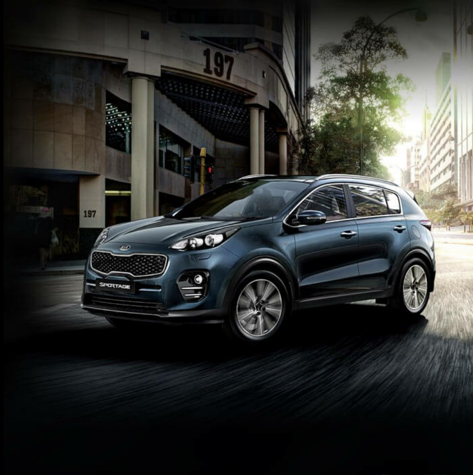
Platinum model shown

The All-New Sportage brings a modern, progressive design approach to the medium SUV segment. Underneath the stunning styling, you'll discover an all-new platform and handling package that's tuned in Australia, by Australian engineers. Inside, a completely redesigned cabin, choice of petrol or diesel engines across the range and Kia's latest technologies can be found.