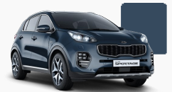
Mercury Blue *