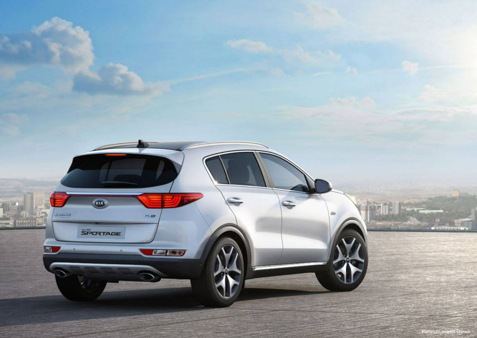
Platinum model shown