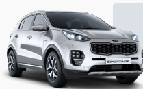
Sparkling Silver *