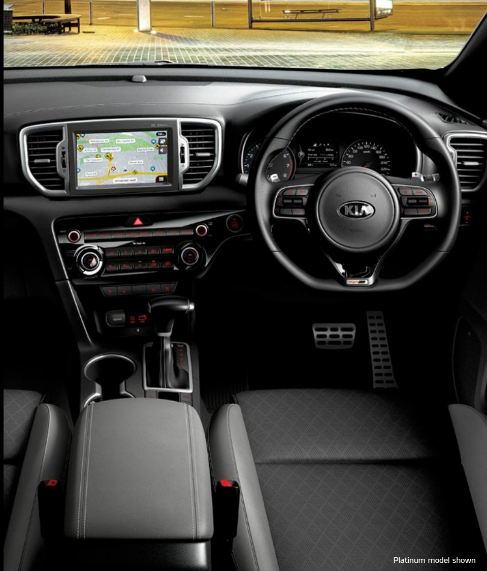
Platinum model shown

Diamond-shaped perforations feature on the two-tone interior option ^ for the All-New Sportage Platinum. ^ Grey two-tone leather is exclusively available as a no cost option on platinum models with selected exterior colours: Snow White Pearl, Sparkling Silver Mercury Blue, Cherry Black. * Leather trim may include some leather like materials on selected high impact surfaces.