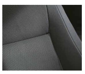
GLX - Fabric