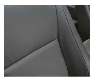
Exceed - Leather seat facings