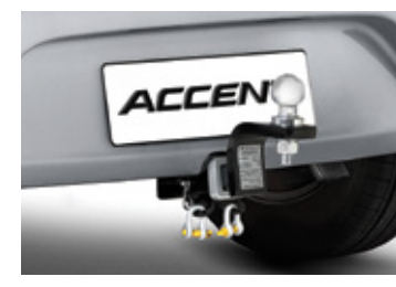
Towbar, towball & trailer wiring harness<sup>6</sup>