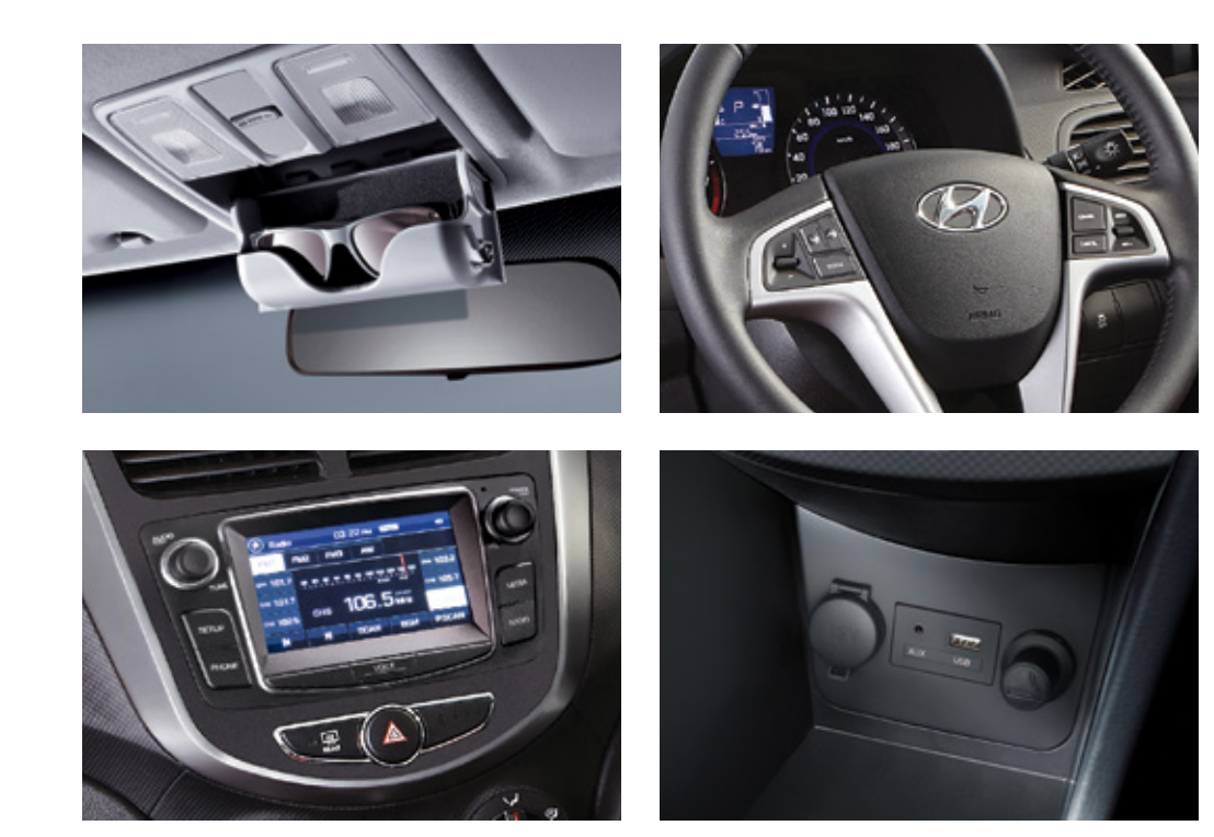
Top: Sunglass compartment Bottom: 5" touchscreen

Every control and button has been positioned for easy use and navigation, so you can focus on driving but still get the most fun out of every trip.