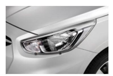
Headlight protectors (set of 2)