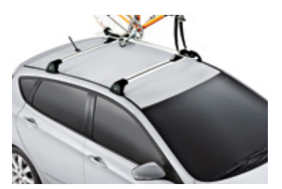
Roof mounted bike carrier

1. All Hyundai Genuine Accessories are backed by a 5 year warranty if purchased at the time of a new Hyundai vehicle and fitted by an authorised Hyundai Dealer. All Hyundai Genuine Accessories are subject to warranty conditions. See your nearest Hyundai Dealer or visit our website at www.hyundai.com.au for full warranty terms and usage recommendations. 2. Auxiliary cable not suitable for Apple® devices. 3. iPad® is a registered trademark of Apple Inc. The iPad® holder has been designed to hold iPad® 1, 2, 3, 4 & iPad Air securely. To ensure occupants are protected in the event of a collision, the screen protector must be fitted to the iPad® when in use. iPad® not usable for use with retractable seatbelt. 5. Mudflaps cannot be fitted in conjunction with a full bodyskirt or rear skirt. 6. Maximum ball download 50kg. Towing capacity = 900kg braked, 850kg Auto & 900kg Manual unbraked. Towbar capacity subject to regulatory requirements, towbar design, vehicle design and towing equipment limitations. 7. Load capacity = 75kg distributed evenly over 2 bars. Roof racks should be removed when not in use. 8. Requires fitment of Whispbar" quiet roof racks at additional cost. Bike, snowboard and surfboard not included. 9. Park assist is designed as driver assist aid only and should not be used as a substitute for skilled driving and safe parking practices (sensors do not pick up oviscul) monitored by the driver at all times while parking.