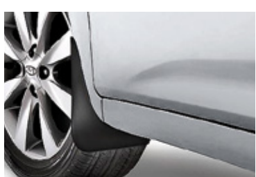
Front & rear mudflaps (set of 2)5