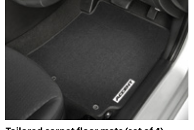
Tailored carpet floor mats (set of 4)