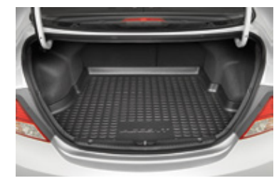
Rubber cargo liner