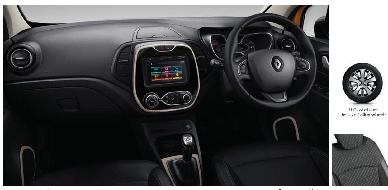
Contrasting interior decor