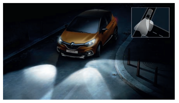
Additional cornering lights* When taking corners, the fog light on the side nearest the bend lights up automatically to give you a wider field of vision.

The system detects the presence of any vehicle in the area that your rear-view mirrors do not allow you to see. Enabled between 30 and 140km/h, the blind spot warning system immediately activates a warning light.