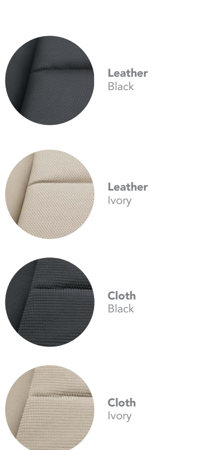
1. Some parts of the seating or trim are not full natural leather.

On the inside choose from black or ivory cloth. Sumptuous leather<sup>1</sup> is available on selected variants and in a choice of ivory or black.