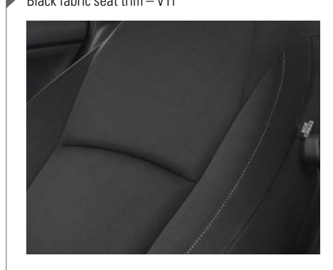
Black fabric seat trim - VTi