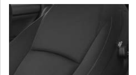
Black fabric seat trim - VTi