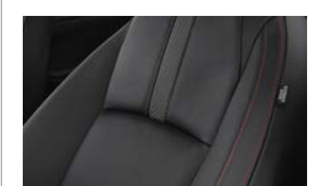
Black leather-appointed† seat trim with red stitching - RS