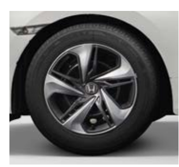
16" steel wheels - VTi