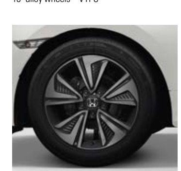
17" alloy wheels – VTi-L