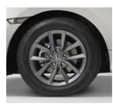
16" alloy wheels – VTi-S