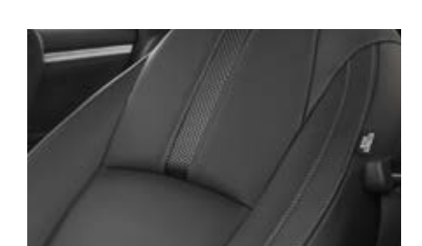
Black leather-appointed<sup>†</sup> seat trim with chequered accent - VTi-LX