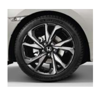
18" alloy sports wheels – RS