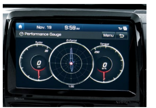
Digital performance gauge<sup>2</sup>