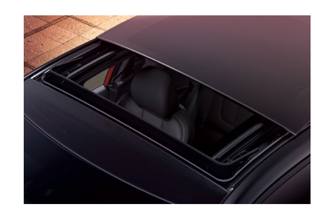
Full width glass sunroof