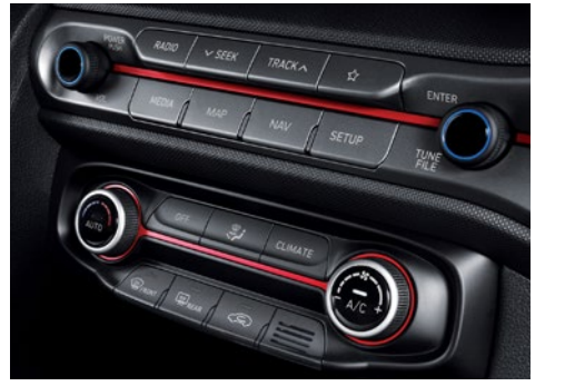
Piano black audio unit