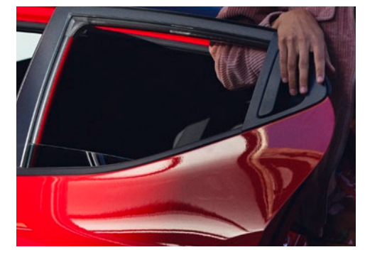
Top: Sporty front grille<sup>1</sup> Bottom: Hidden door handle