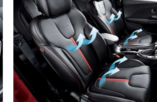
Top: Head-Up Display (HUD)4 Bottom: Heated & ventilated front seats4