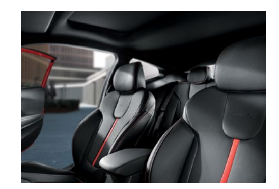
Leather-appointed<sup>1</sup> sport bucket seats with red accents.

The Veloster's interior, then, is that home away from home you're looking for, but it's also a home filled with plenty of serious, sporting intent.