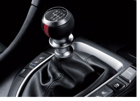
6-Speed manual transmission

1. Available on Turbo and Turbo Premium variants.