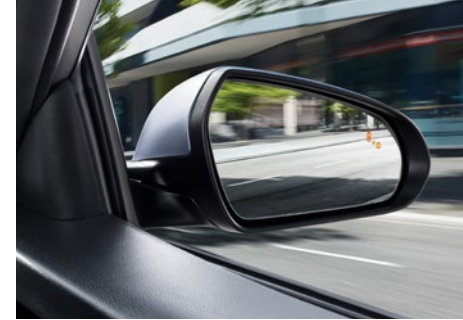
Blind-Spot Collision Warning (BCW)<sup>2</sup>

The Veloster uses sophisticated forward-facing camera to read the road markings, and won't just warn you if you begin to drift out of your lane, but will even take control of the steering wheel to gently pull you back into the centre of your lane.