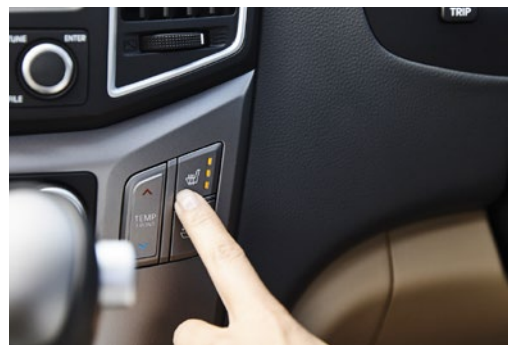
Top: Separate air conditioning controls for 2nd & 3rd row passengers<sup>3</sup> Bottom: Heated front seats<sup>2</sup>