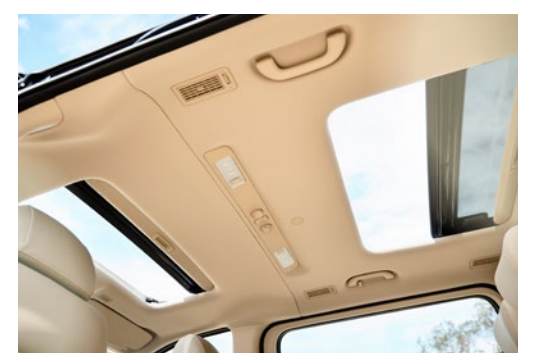
Top: Leather appointed<sup>1</sup> interior Bottom: Dual sunroofs<sup>2</sup>