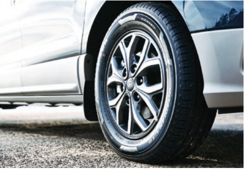
Top: Dual sliding doors<sup>1</sup> Bottom: Alloy wheels<sup>1</sup>