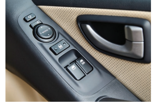
Driver's window one-touch auto up/down<sup>3</sup>

1. Apple CarPlay<sup>TM</sup> functionality requires software update. Apple CarPlay<sup>TM</sup> requires iPhone<sup>®</sup> 5 or subsequent model (lightning cable) in order to operate. Apple<sup>®</sup> and iPhone<sup>®</sup> are registered trademarks of Apple Inc.