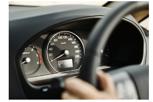
Supervision cluster with trip computer