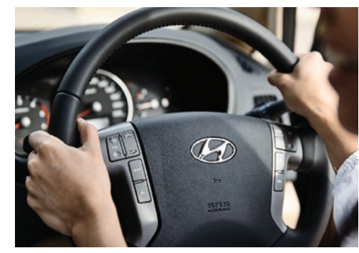
Steering wheel mounted audio controls<sup>3</sup>