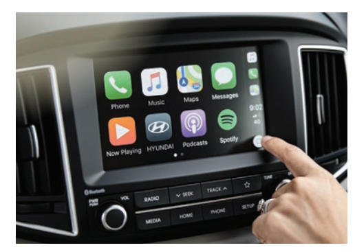
7" touchscreen audio system with Apple CarPlay<sup>™1</sup> and Android<sup>™</sup> Auto<sup>2</sup> compatibility

The iMax will allow you to enjoy features that'll help you stay in sync with your world, yet still focus on the road.