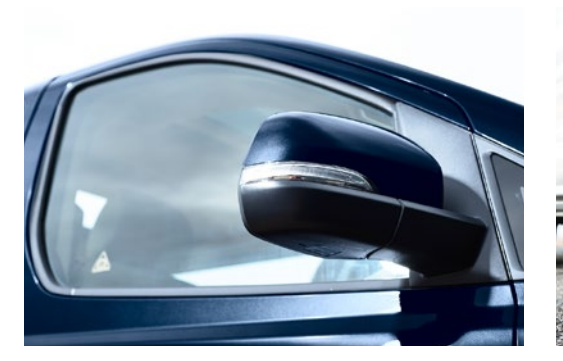
Top: Automatic dusk sensing headlamps<sup>1</sup> Bottom: Electronic folding side mirrors with integrated side repeater<sup>1</sup>