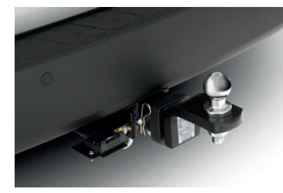
Top: Fabric bumper protector Middle: Tailored carpet floor mats – front and second row only Bottom: Towbar, towball & trailer wiring harness<sup>5</sup>