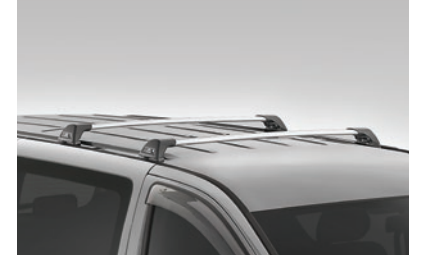
Top: Roof pod 395L<sup>11</sup> Middle: Tailored carpet floor mats – third row only Bottom: Roof racks<sup>7</sup>