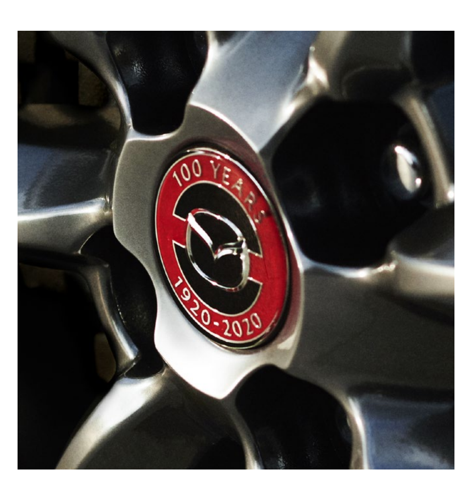
Images are representative only and may vary depending on Mazda model