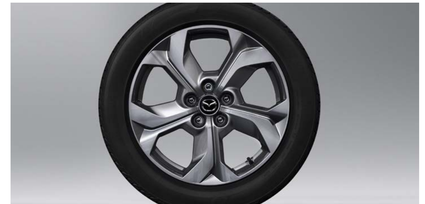
18-inch bright alloy