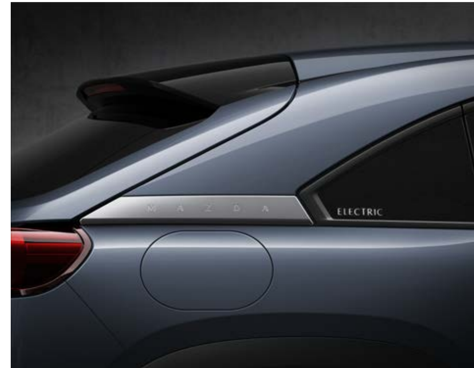
Polymetal Grey Metallic