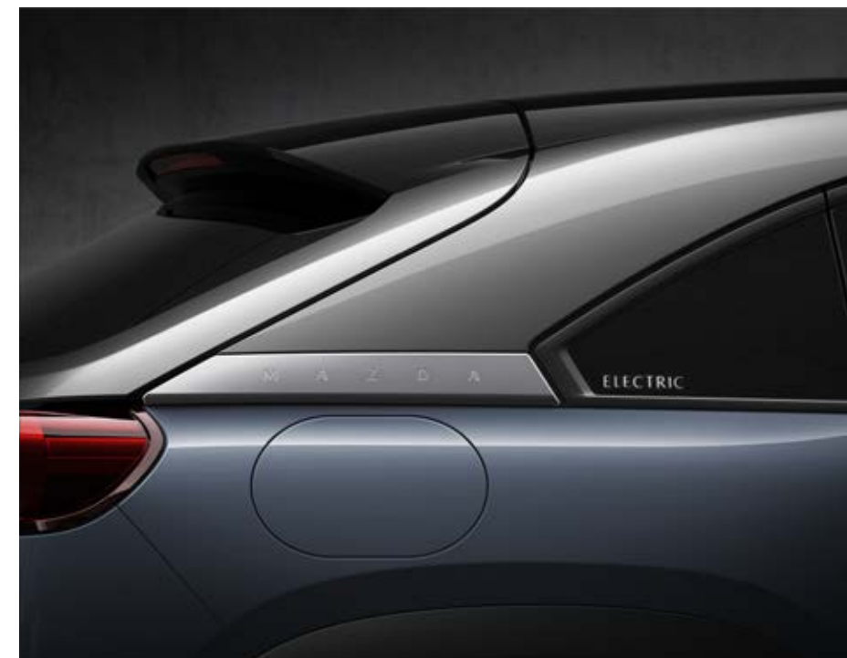
Polymetal Grey Metallic with black roof top and silver sides.