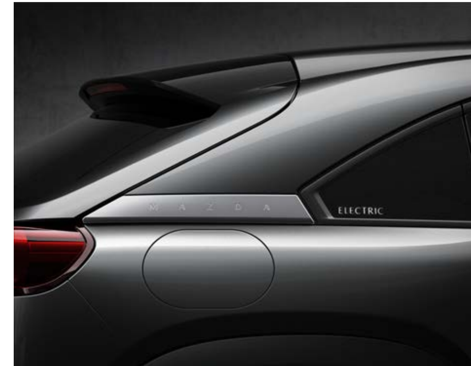
Machine Grey Metallic