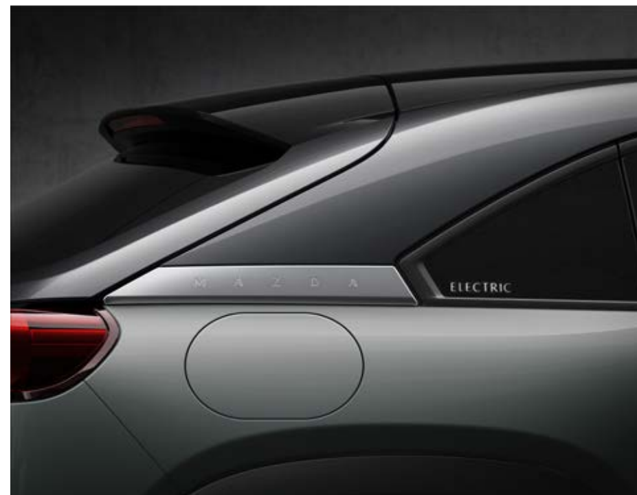
Ceramic Metallic with black roof top and grey sides.