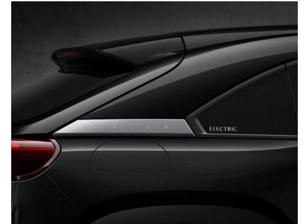
Jet Black Mica